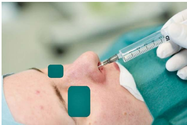
Fig. 1. Preincisional nose infiltration of levobupivacaine before rhinoseptoplasty surgical procedure.