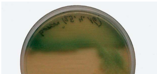
Fig. 3. After 24 hours, the used BHI was inoculated on a solid nutrient medium (Columbia agar, Merck, Burlington, Massachusetts, USA) as a control of bacterial growth of used strains.

and exiting on the other side. Drills were then autoclaved (gravity-displacement steam sterilization; Tuttenauer GS Hospital Autoclave) for 15 minutes at 132 °C and 2.6 bar 11-13 . Empty autoclave chamber was neither sterilized nor tested for sterility prior to the experiment. After 24-hour autoclaving the drills, they were taken out of the autoclave and again immersed in BHI and incubated for 24 hours at 37 °C. Liquid culture medium (BHI) used was then inoculated on solid nutrient medium (Columbia agar, Merck, with the ad-