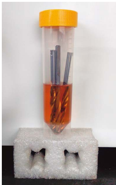
Fig. 2. Drills immersed in liquid culture medium Brain Heart Infusion Broth, Oxoid (BHI) that was previously inoculated with Pseudomonas aeruginosa , Bacillus sp. , beta-hemolytic Streptococcus sp. , Enterobacter sp. and methicillin-resistant Staphylococcus pseudintermedius (MRSP).