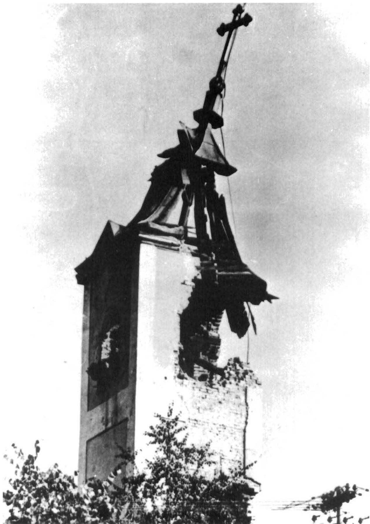
Sarvaš, crkva sv. Ivana Krstitelja Sarvaš, St. John the Baptist Church