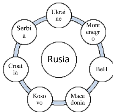
Figure 2. Russia spider diplomacy: Authors' own compilation

As a kind of evidence to draw some diligent explanations of "spider diplomacy", we have stopped at two quick examples, one involving Russia and the other with the Western Balkans.