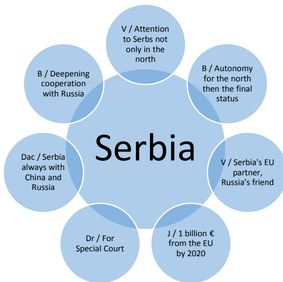
Figure 3. Serbia spider diplomacy: Authors' own compilation

Ana Brnabic, Serbia's prime minister, then stated that a dialogue on autonomy for northern Kosovo needs to be discussed and then talks on the final status of Kosovo, and if Serbia is obliged to choose between the EU and Russia, it will choose the EU -in (Savic & Filipovic, 2017).