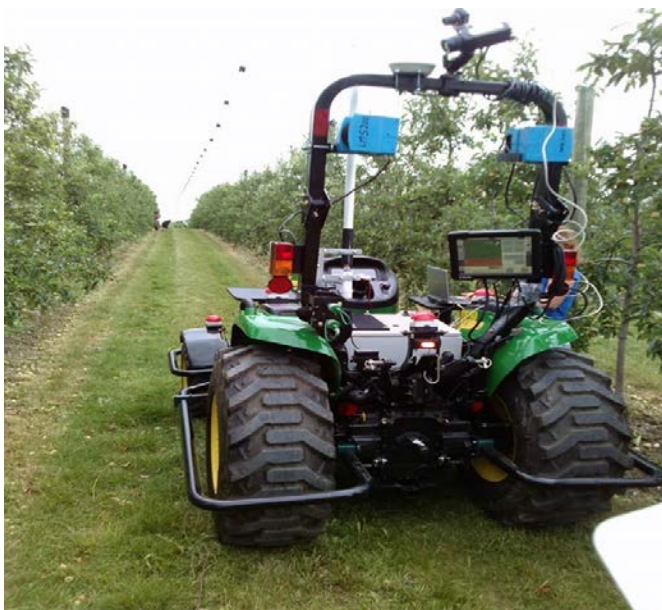
Figure 2. Sensors mounted on robotic platform during field data collection

Mobile sensors are mounted on a portable platform (robotic vehicle) that can be remotely guided in the field to make imaging by several sensors such as thermal camera, RGB, hyperspectral camera and laser scanner, simultaneously. During data collection, portable computer and wet reference bath are attached to the mobile platform. A picture of the mobile platform with sensors mounted on it during in-field data collection is shown in Figure 2.