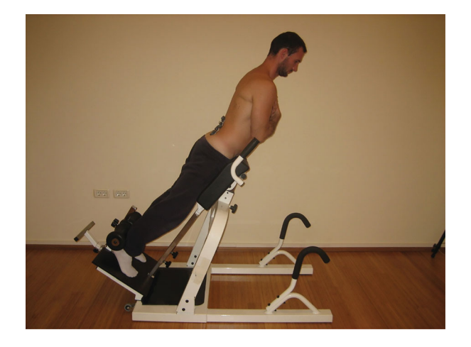
Figure 2. The tilting device used for testing with subject placed in starting position.

The high-pass cutoff frequency of 20 Hz was chosen as recommended to be optimal choice for general use [40].