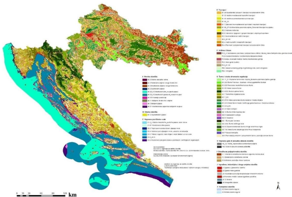
Figure 1. Ecosystems map of Croatia [18]