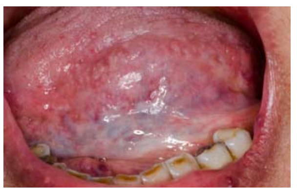
Figure 1a. Whitish lesions on the ventrolateral part of the tongue in patient with lichen sclerosus

Oral LS is clinically characterized by the appearance of white macules, papules, or plaques mostly appearing on labial mucosa but also on buccal, palate mucosa and on the lower lip (2,3). On the genitals, it typically manifests as atrophic white plaques, which may be accompanied by purpura or fissuring (1). While vulvar LS is often associated with pruritus, dyspareunia, and dysuria, OLS is often asymptomatic, although pain, soreness, pruritus, and tightness when opening the mouth can be present (1,2). Oral manifestations of LS, as well as association of anogenital and oral LS, are rarely reported in the literature (4-6). Tomo et al. searched the Medline database for papers reporting oral LS cases with histological diagnosis confirmation from 1957 to 2016 and found only 34 cases of oral LS with histopathologic confirmation of the diagnosis (4). Kakko et al. reported 39 histologically proven cases of OLS (2). Attilli et al. (5) reviewed