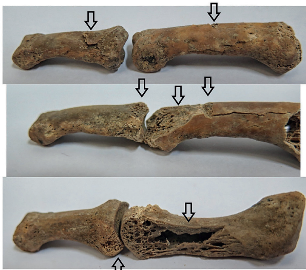
Fig. 3. Male skeleton aged between 30 and 35 years at the time at death from grave 1 (SU 146). Seven perimortem traumas on the left hand.

Apart from traumas recorded in adults, a subadult (SU 240) exhibits an antemortem injury to the left part of the frontal bone. The injury penetrated the inner table of the skull but the rounded and partially healed margins of the wound together with the presence of active periostitis suggest that, at least for some time, this individual survived the wound.