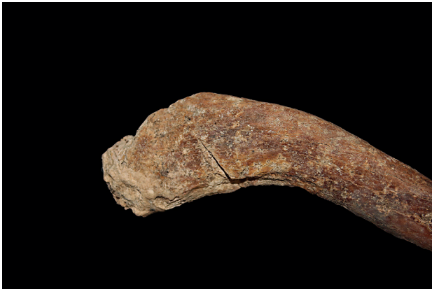
Fig. 2. Male skeleton aged between 30 and 35 years at the time at death from grave 1 (SU 146). Perimortem trauma on the right clavicle.