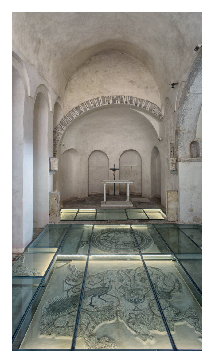
Fig. 3. St John's Church in Stari Grad.