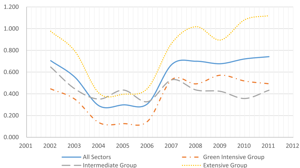
Figure 1. Trend of environmental regulation intensity by clusters of industrial sectors from 2001 to 2011.