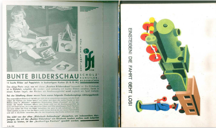
Fig. 8. Bunte Bilderschau für unseren Liebling (1935) by Fritz Westenberg. Mainz: Scholz. The book consists of a cardboard case with coloured cardboard plates. Sl. 8. Bunte Bilderschau für unseren Liebling (1935) Fritz Westenberg. Mainz: Scholz. Knjiga se sastoji od kartonske kutije u kojoj su kartonske kartice u boji.

house as indicated in the photo. To successfully achieve this goal, the child must have acquired fine motor skills as well as physical knowledge about the correct balance and positioning of the single boards to build a stable construction. Westenberg's book is a perfect example of hybrid artwork that may be regarded as a picturebook and as a learning toy at the same time. The pedagogical considerations printed on the inner side of the box clearly state that this 'picturebook' offers children the opportunity to acquire knowledge about the objects depicted on the cardboard pieces as well as the possibility to develop creative play. In this regard, the accompanying text mentions the notion of "Anschauung", 22 which perfectly describes the main task of the book: it provides knowledge by means of visuals. Yet the German term also points to a crucial aesthetic and educational principle of the Enlightenment, which stresses the significance of pictures for the child's acquisition of world knowledge (see Grenby 2011 and O'Malley 2003). Likewise, by using the boards for building purposes, children are permanently invited to look at the pictures, thus storing their visual codes in their mind.