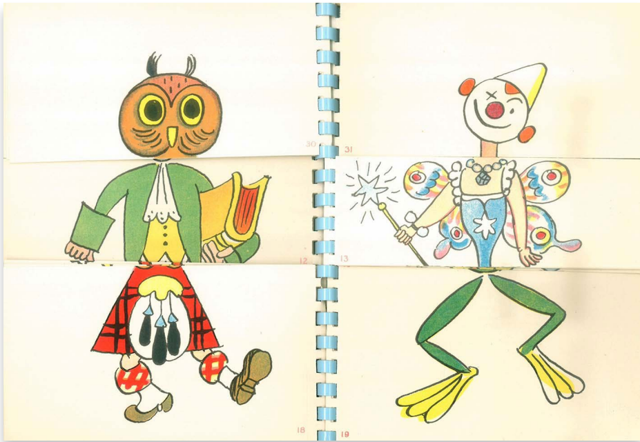
Fig. 5. A doublespread of Crazy People (1946) by Walter Trier. London: Atrium. The reader can create funny people by randomly turning the flaps.

Sl. 5. Dvostranica slikovnice Crazy People (1946) Waltera Triera. London: Atrium. Čitatelj može sastavljati smiješne likove nasumičnim okretanjem razrezanih dijelova stranica.