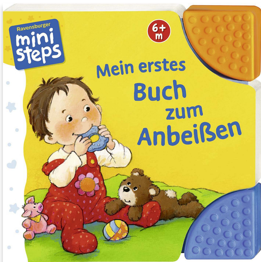
Fig. 7. Cover of Mein erstes Buch zum Anbeißen (2011) by Regina Schwarz, with illustrations by Katja Senner. Ravensburg: Ravensburger Buchverlag. The inserted soft triangles in the upper and lower right-hand corners resemble cookies.

Sl. 7. Prednja strana korica slikovnice Mein erstes Buch zum Anbeißen (2011) Regine Schwarz s ilustracijama Katje Senner. Ravensburg: Ravensburger Buchverlag. Ubačeni trokuti od mekanoga materijala u gornjem i donjem desnom uglu podsjećaju na kekse.