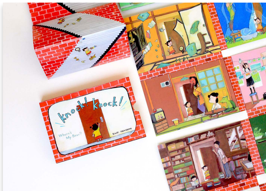
Fig. 9. Pages of Knock! Knock! (2015) by Kaori Takahashi. When folded out, the reader is able to follow the little girl's route from her apartment to the neighbours' apartments up to the roof and back again. Original Edition © Tara Books Pvt Ltd, Chennai, India. Reprinted with kind permission of Tara Books.

Sl. 9. Stranice slikovnice Knock! Knock! (2015) Kaorija Takahashija. Kad se slikovnica rasklopi, čitatelj može pratiti djevojčičin put od njezina do susjedova stana pa na krov i natrag. Izvorno izdanje © Tara Books Pvt Ltd, Chennai, Indija. Objavljeno uz ljubaznu suglasnost Tara Books.