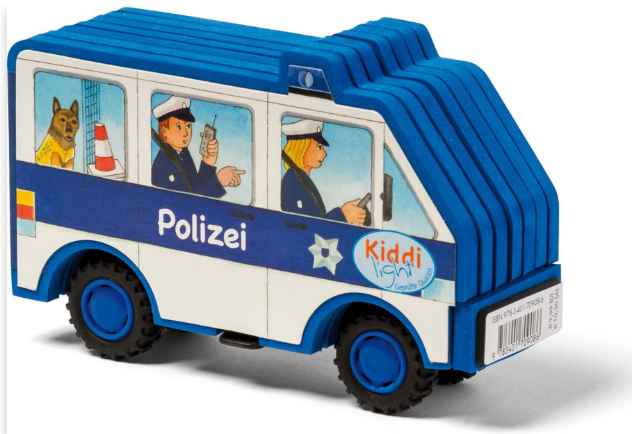
Fig. 6: Mein Kiddilight-Auto. Polizei (2007) by Urs Wagner. © 2007 Arena Verlag GmbH, Würzburg. Reprinted with kind permission of Arena Verlag. The closed book has the shape of a car with wheels. The opened book tells a story about the multiple tasks of the police. Sl. 6. Mein Kiddilight-Auto. Polizei (2007) Urs Wagnera. © 2007 Arena Verlag GmbH, Würzburg. Objavljeno uz ljubaznu suglasnost Arena Verlag. Zatvorena knjiga oblika je automobila s kotačima. Otvorena knjiga posreduje priču o brojnim policijskim zadacima.

These rules foster a stereotypical concept of the picturebook that has to do with its predominant function, namely to be read. Yet the picturebook, as a material object, affords several other activities, 21 some functionally unintended and some functionally intended.