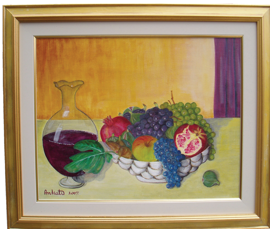
ANIJA MATIČEVIĆ – Hommage à Caravaggio (Vino i voće), 2007. ulje na platnu, 40x50 cm