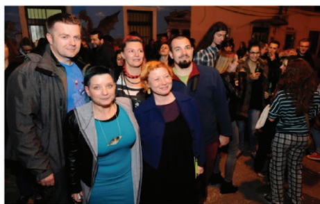
Figure 2 Newspaper article in Novi list with German loanword "birtija" in the headline. Source: http://www.novilist.hr/Vijesti/Rijeka/Scena/Posljednjih-100-Palach-je-i-pos-o-i-kuca-i-birtija (16.6.2015)