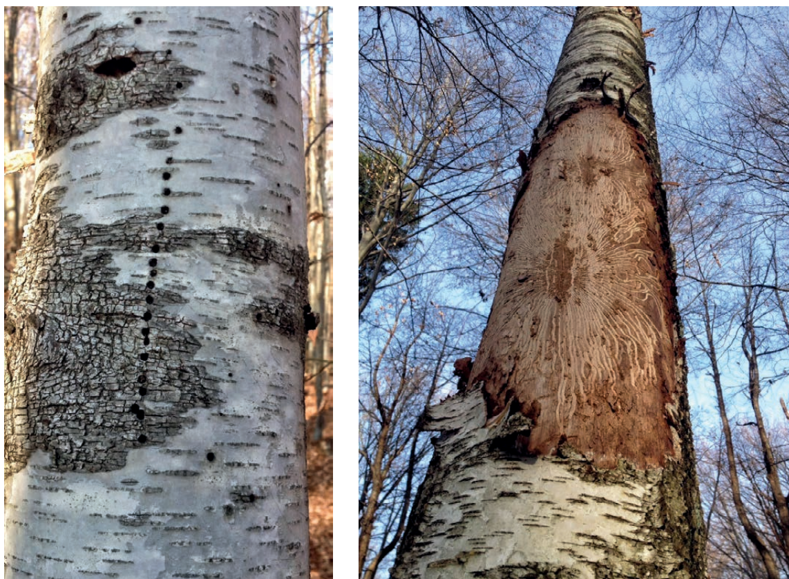
Figure 2 The Birch bark beetle ( Scolytus ratzeburgi Janson, 1856): a) ventilation holes along oviposition tunnel; b) typical gallery system with bark removed

tle are holes on the bark located along the oviposition gallery (Figure 2). These holes may serve for mating locations (Trédl, 1915a; Trédl, 1915b; Munro, 1926; Kovačević, 1956) or for ventilation – humidity regulation (Melnikova, 1964). The holes, 2.0 – 2.5 mm in diameter, on the trunk are spaced along a vertical line up to 20 cm long (Trédl, 1915a; Trédl, 1915b; Melnikova, 1964; Zúbrik et al. , 2013). Birch