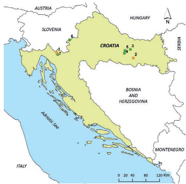
Figure 3 Historical (orange points: 1, 2) and current records (green points: 3-7) of the Birch bark beetle ( Scolytus ratzeburgi Janson, 1856) in Croatia.

To determine the presence of Birch bark beetle in Croatia, Silver birch stands were examined throughout Croatia from 2016 to 2017. Logs were sampled at three localities through-