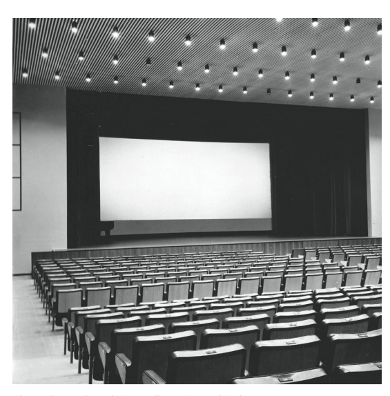
Figure 8. Interior of Moša Pijade Workers' University in Zagreb (1961), Great Hall.

An optimal space was created through a study of teaching methods: a "seminar" unit for a group of 15-20 participants. Instead of rigid classrooms, the interiors were designed according to individualised and dynamic teaching methods and programmes and fitted with modular furniture and fittings that could be arranged in various combinations, which enabled direct and more democratic communication within a group (Figure 9). Thus teaching models and educational programming generated the building's spatial structure based on a spatial module of 7x7 metres.