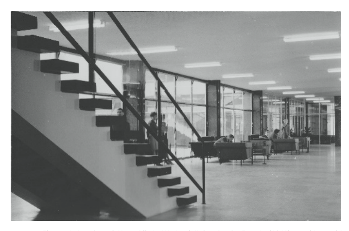
Figure 6. Interior of Moša Pijade Workers' University in Zagreb (1961), corridors with the "islands for rest".

The total surface of 20,000 m² was designed as a small city for around 5,000 daily visitors. Within the complex, spaces include inner streets and squares, open inner courtyards, halls and classrooms. Each space is given its own specific meaning by its position, use and fittings, but above all by its relationship to other spaces, to the whole and to the content of the site. The corridors, pathways and foyers play a key role as multifunctional spaces for communication. Special attention was paid to the "islands for rest" that were carefully distributed throughout the building (Figure 6). The purpose of shaping transparent spaces was to achieve an atmosphere and emotional quality whereby workers and visitors could feel "at home". Nikšić defined the main idea of architectural design as a space—time concept, undoubtedly evoking Siegfried Giedion's theory set forth in his influential book Space, Time, Architecture, first published in 1941 (Nikšić 1958). The spaces were vertically connected with several freely situated stairways, forming a "continuous" floating space.