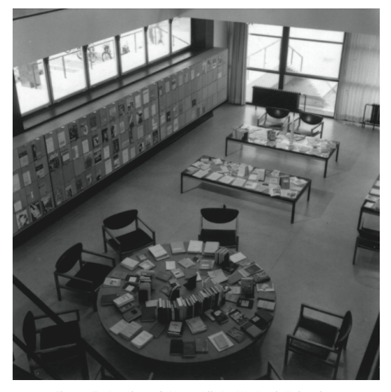
Figure 7. Interior of Moša Pijade Workers' University in Zagreb (1961), Bernardo Bernardi, round table and A4 chairs in the ground floor reading room (source: Library of the Public Open University Zagreb, photo: Željko Krčadinac).

accordance with what the space would be used for). According to the principle of synthesis, Bernardo Bernardi designed all of the interior fittings, which created an organic whole of highly individualized spaces that could be easily modified. In addition to the educational units, the space included a large library with a reading room and a documentation centre (Figure 7), editorial offices for ambitious publishing activities with printing facilities and numerous additional activities. Special attention was paid to the design of the two multifunctional auditoriums, one with 600 seats (Figure 8) and the other with 220, planned for conferences, concerts, theatrical performances and film screenings. The cultural education programmes were particularly interesting and ranged from introductory to more advanced courses. The visual arts syllabi focused on understanding and experiencing art and included art history, modern and contemporary art, and architecture and design.