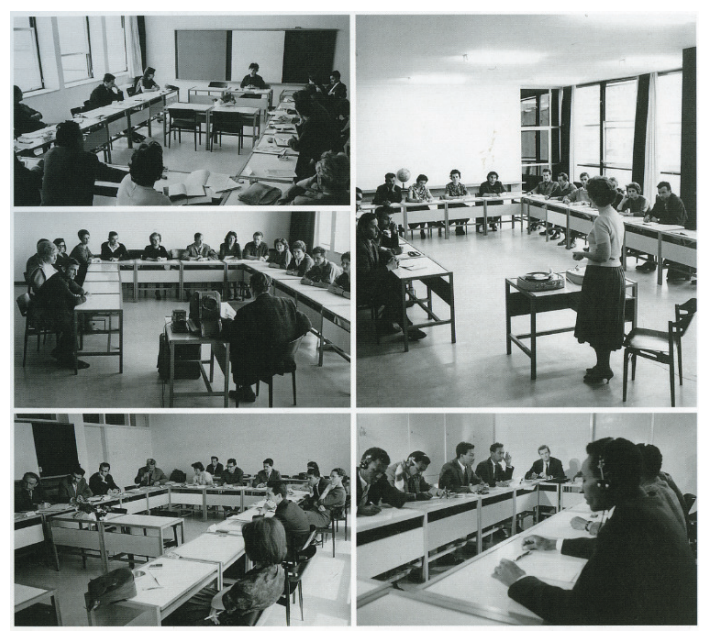
Figure 9. Interior of Moša Pijade Workers' University in Zagreb (1961), spatial module — a seminar room with desks that could be easily moved around to accommodate different teaching methods.