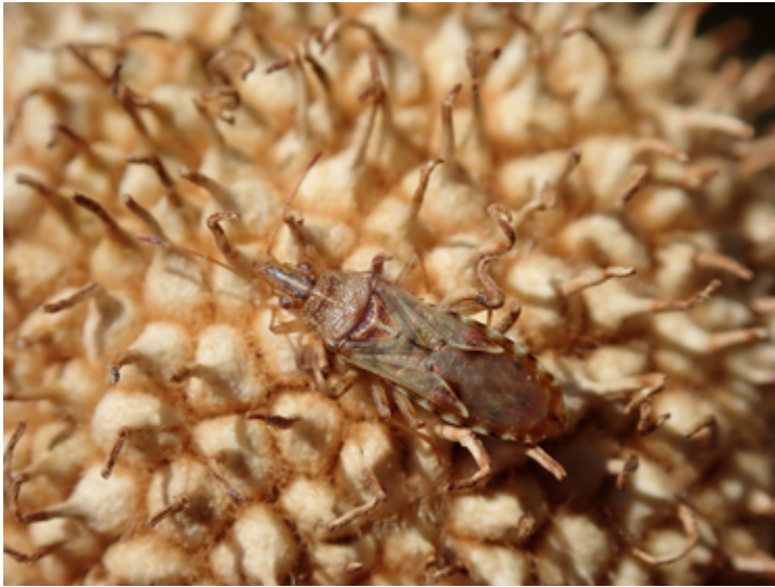
Fig. 1. Belonochilus numenius photographed on Platanus orientalis in Dubrovnik city.