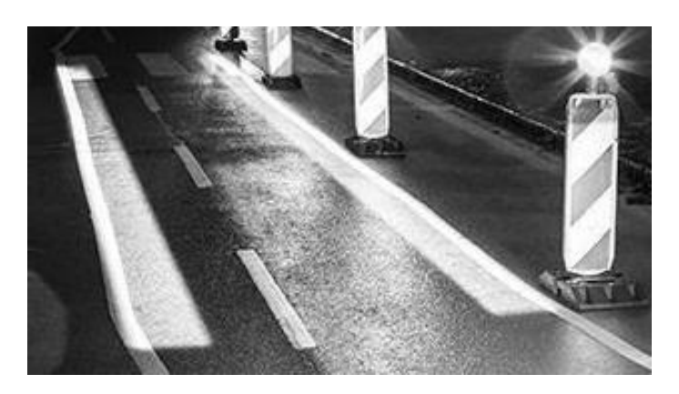
Figure 2. Fake lanes.