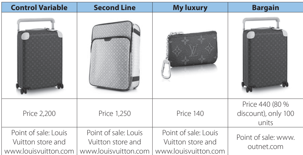
FIGURE 6: Images of different stimuli

a traditional item with a regular price and regular distribution channel was included. The same stimulus of the control condition was used as an aspirational scenario to ascertain the future expected relationship of the survey participants with the brand. They were randomly assigned to three different conditions.