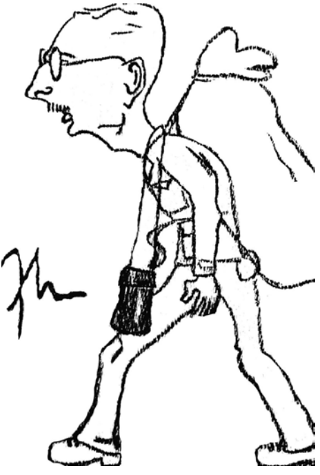
Figure 1. Zvonimir Maretić's caricature of himself as a scientist and adventurer (family archive)

After the end of World War II, Italian medical doctors emigrated from Istria to Italy. The shortage of physicians in Pula encouraged Maretić to leave Zagreb. It was in Pula in 1948 where Maretić started the research of the then poorly understood poisoning caused by the sting of black widow spider – latrodectism<sup>16</sup> that spread all over Istria. As Maretić states,