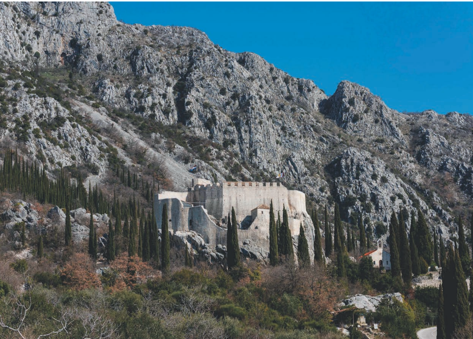
Sl. 1. Pogled na utvrdu Sokol s jugozapada