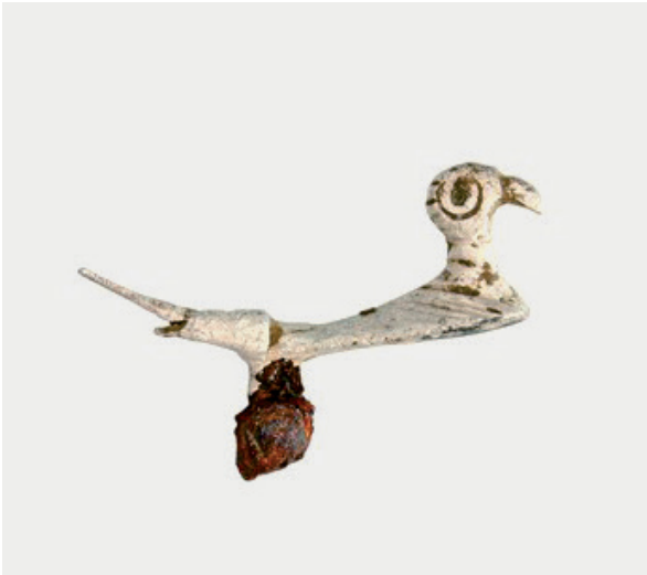
Sl. 3. Srebrna pticolika fibula iz Ljute Fig. 3 Silver bird-shaped fibula from Ljuta

stavljaju se dvije četvrtaste pločice. Na onoj bliže repu naknadno se trebala probušiti rupa zbog fiksiranja osovine spiralnog nosača željezne igle. Od prsa se prema dolje nastavlja druga ravna pločica. Nakon što bi se savila u obliku slova U , služila bi za zapinjanje vrha željezne igle. Po sredini tijela ptice, naročito oko glave, pruža se tanak razliveni brončani otisak spoja dvodijelnog kalupa ( T. I, 2a ). Pri konačnom oblikovanju fibule on bi se uklonio, a tijelo ptice finije obradilo. Od repa se nastavlja ljevka brončana masa koja je otisak mjesta za ulijevanje vrele tekuće bronce u kalup. Krila i oči ptice urezivali su se naknadno, pri ukrašavanju i definiranju izgleda fibule. Na kraju se umetao mehanizam za kopčanje čija bi se osovina provukla kroz rupu na pločici smještenoj bliže repu. Tetiva spirale zakvačila bi se s unutarnje strane pločice. Osim brončanih fibula na Sokolu su se izrađivali i srebrni primjerci pticolikih fibula, kako pokazuje nalaz iz Ljute u Konavlima.