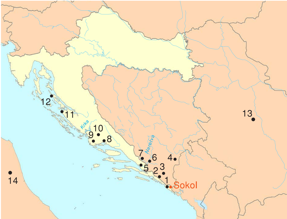
Karta rasprostranjenosti pticolikih fibula

Map of distribution of bird-shaped fibulae