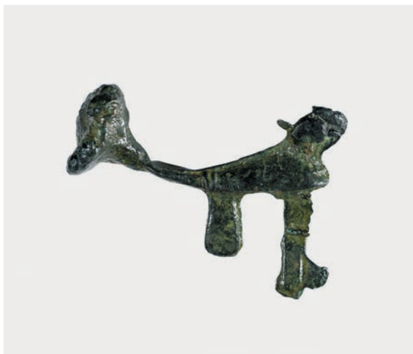
Sl. 2. Škart pticolike fibule sa Sokola Fig. 2 Rejected bird-shaped fibula from Sokol