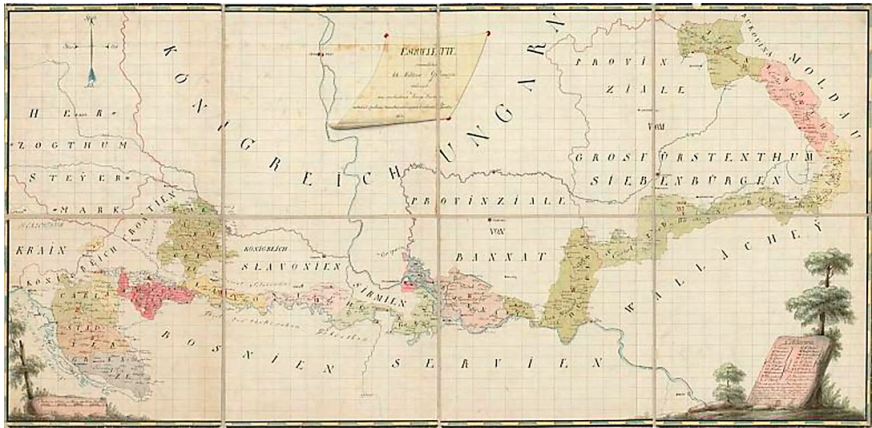
FIGURE 1 Military Frontier in 1800