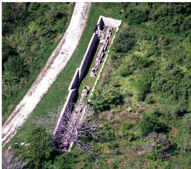
Sl. 4. "16 sarkofaga"