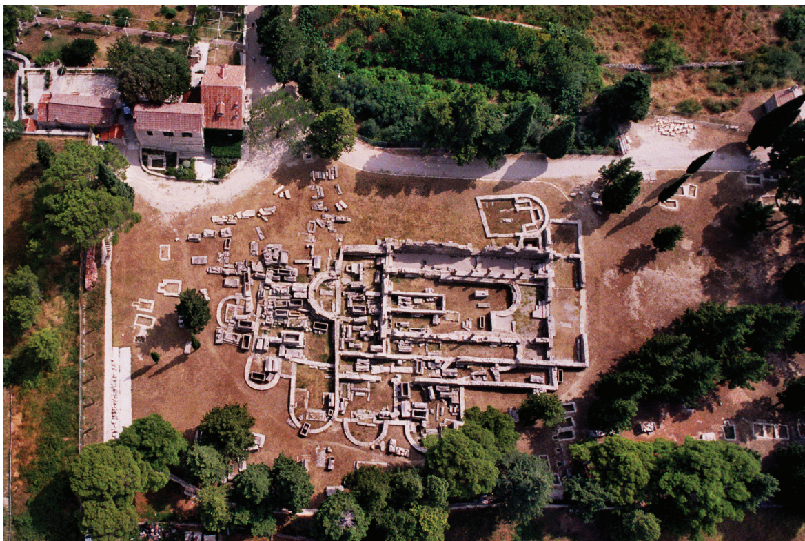
Sl. 6. Manastirine - antička komunikacija u pravcu zapada nalazi se ili ispod današnjeg puta ili nešto južnije