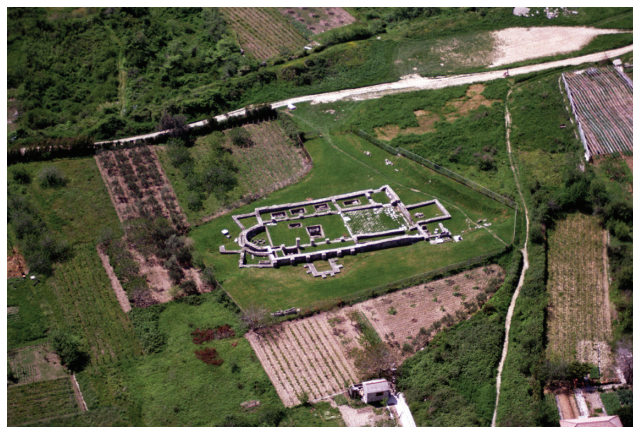
Sl. 5. Lokalitet Kapljuč. Antička cesta se vjerojatno nalazi između bazilike i bedema

Fig. 5. Kapljuč site. The Roman road is probably situated between the church and town walls