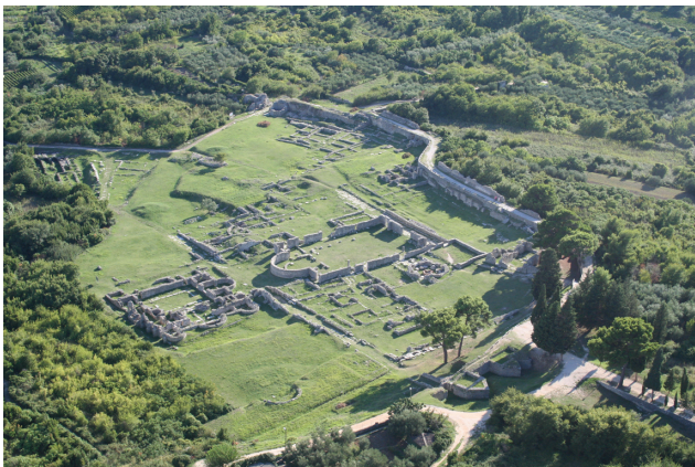
Sl. 3. Episkopalni centar s tzv. Petrovom ulicom između bazilika i termi