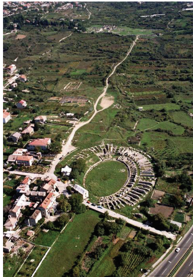
Sl. 2. Na fotografiji je vidljiv položaj bedema s lokalitetima Kapljuč i "16 sarkofaga" na sjevernoj nekropoli