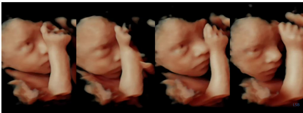
Figure 3. Fetus at 28 weeks of gestation. 4D HDlive surface mode, sequence view. Notice open eyes and alteration in eye movement. Fetus exploring surrounding environment