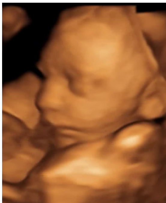
Figure 5. Fetus 24 weeks gestation. 4D surface view of the fetal face, no mimics