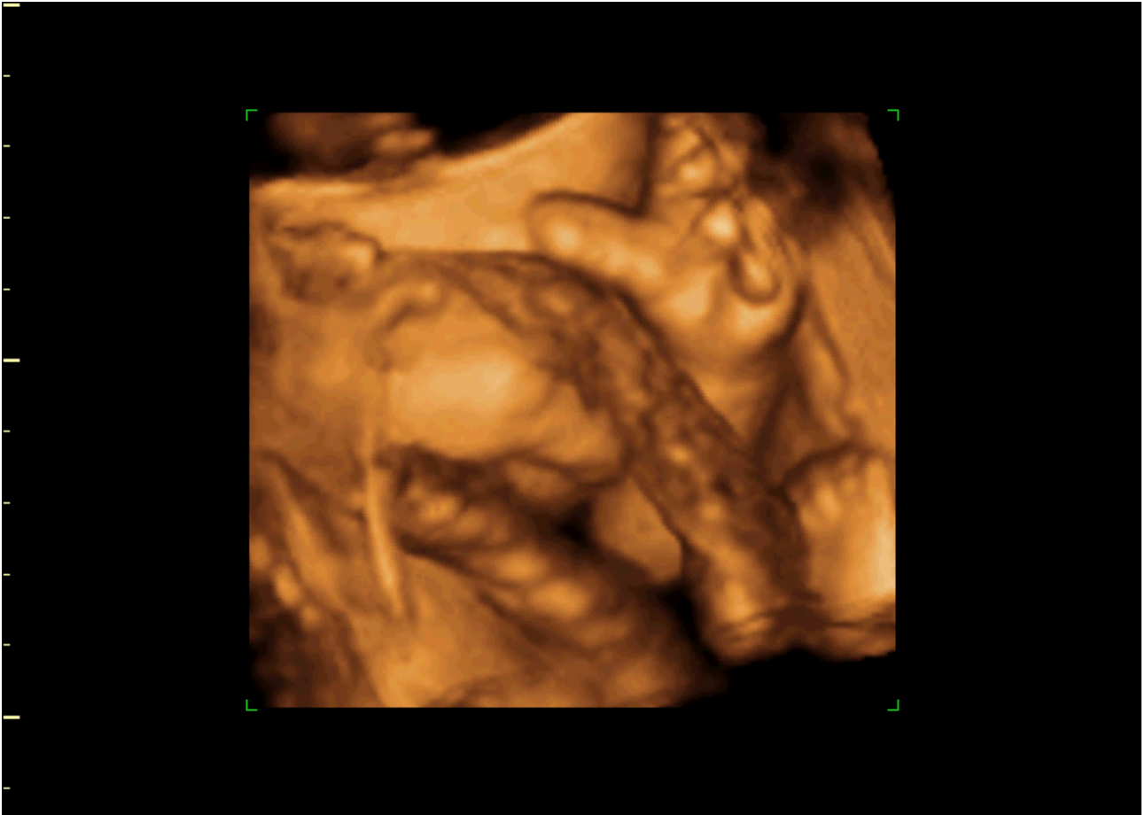
Figure 1. Goal directed movement of the hand towards the umbilical cord