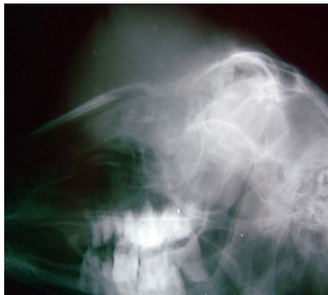
Fig. 3. Lateral radiograph of the head of a goat with enzootic nasal adenocarcinoma. Notice the soft tissue density mass unilaterally filling the nasal passages including sinuses and turbinates

Two radiographic views (lateral and ventrodorsal) of the skull were taken of all affected animals using a portable digital radiographic machine. Radiographic examination of the skull revealed a large, soft-tissue density mass originating in the nasal turbinate and invading the surrounding nasal structures (Fig. 3).