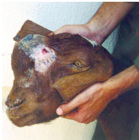
Fig. 2. Enzootic nasal adenocarcinoma in a goat with facial distortion