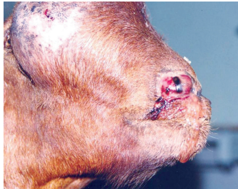
Fig. 1. Enzootic nasal adenocarcinoma in a sheep with a unilateral facial distortion. Notice the small mass protruding from the right nostril

weak. Mild to moderate inspiratory/expiratory dyspnea characterized by loud respiration was found. One of the sheep was presented with a severely distorted left frontal region with skin hyperkeratosis, wool loss and abnormal hard growth resembling a horn. Another sheep was presented with a large traumatized polyp-like structure extending from its right nostril (Fig. 1). The third sheep and two goats were presented with variable degrees of facial distortion (Fig. 2).