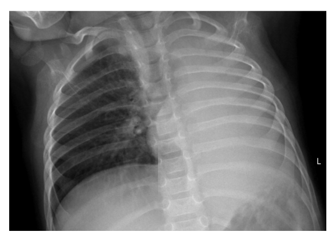
FIGURE 1. CHEST X-RAY AT ADMISSION

Empirical antibiotic therapy with ceftriaxone was started, initially without the need for oxygen therapy. Since foreign body aspiration was suspected due to the radiological finding, bronchoscopy under general anaesthesia was performed at the Department of Otorhinolaryngology, Head and Neck Surgery, University Clinical Hospital Center "Sestre milosrdnice". A foreign body obstructing the left main bronchus was detected. Four peanuts, which obstructed all segmental bronchi, were removed with a rigid bronchoscope. After removal, no other foreign bodies were visualized. The patient was then transferred to the Paediatric Intensive Care Unit, University Hospital for Infectious Diseases "Dr. Fran Mihaljević", Zagreb. He was mechanically ventilated with CPAP (continuous positive airway pressure) modality during the first 24 hours. Afterward he was breathing spontaneously and required oxygen therapy during 10 days. The patient