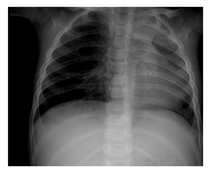
FIGURE 4. CHEST X-RAY ON THE 12TH DAY

Just before hospital discharge, chest X-ray revealed incomplete left lung parenchyma repeated ventilation (Figure 4). He was discharged in good general condition and with normal vital functions.