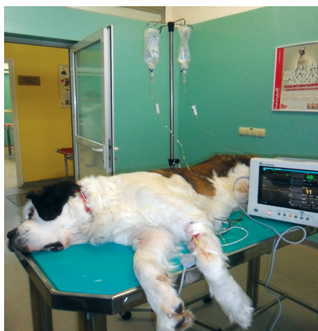
Figure 1. Addisonian crisis in a St. Bernard bitch with a diagnosis of hypoadrenocorticism

nine hypoadrenocorticism. Patient age (12–144 months; 36±79.6 months) and body weight (2.7–56 kg; 21.4±31.8 kg) varied markedly. The most common symptoms were of gastrointestinal origin (Table 1). Hypothermia (Tables 1 and 2) was present in 9/14 (64%) whilst bradycardia was noted in 4/14 (29%) of the investigated dogs (Table 2, Figs. 1 and 2). Eight dogs (57%) were admitted in hypovolemic decompensated shock (Figs. 1 and 2). The clinical examination data, and haematology and biochemistry results are shown in Tables 3 and 4. Twelve of 14 dogs (86%) were azotaemic. Among those, 7/12 (58%) were diagnosed with prerenal and 5/12 (42%) with renal azotaemia.