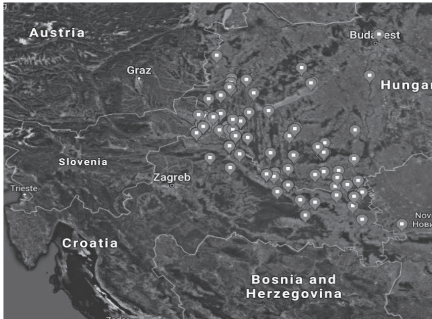
Figure 1. Graphic display of the locations of the implemented projects in the cross-border area

possible future correction methods. In this way negative impacts could be detected timely and included into future measures in order to correct the issues. Positive created impacts should be tracked in order to detect their multiplication strength in the local communities.