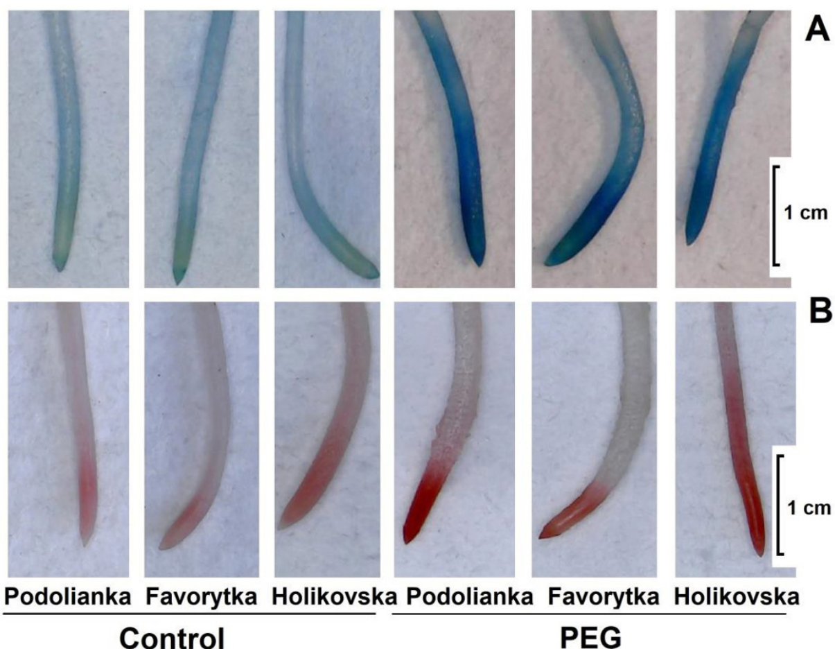
Figure 2. Root membranes damage of different varieties of wheat under the drought stress (A); and root total dehydrogenase activity of different varieties of wheat under the drought stress (B); n=30 (PEG – polyethylene glycol treatment variant)

The coloring of the roots with triphenyltetrazolium chloride showed that root apices of stressed variants evaluated the highest activity of dehydrogenases in the roots of the seedlings of Podolianka and Favorytka varieties (Figure 2, B). It was recorded in the meristematic zone, but in the roots of the Holikovska variety – throughout the length, which may indicate more active breathing processes in Holikovska compared with other varieties under stress condition (Ji et al., 2014).