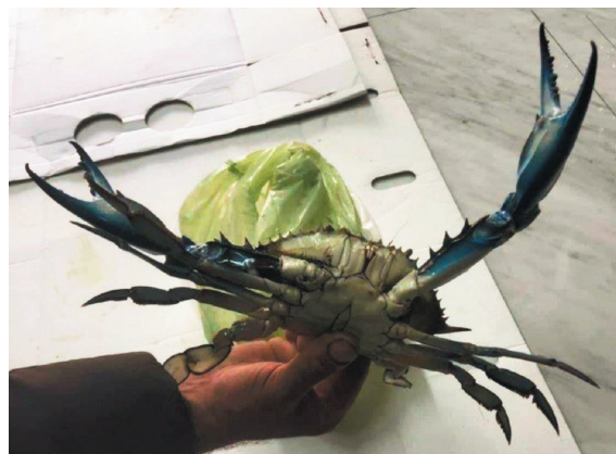
Fig. 3. Callinectes sapidus in NW Sicily, male

generally occur in estuarine habitats, with males tending to remain in low salinity environments longer than females (WILLIAMS, 1984). The high environmental tolerance coupled with wide dietary preferences (MANCINELLI et al. , 2017b) could explain at least partially the invasive success of the blue crab. A clear indicator of such success in the Mediterranean is given by the comparison of distribution maps of this species in the literature, like e.g. those provided by GALIL et al. (2002), GONZALEZ-WANGUEMERT & PUJOL (2016) and LABRUNE et al. (2019), which clearly depict the increase of records and the widening of their distribution through time. Also, the remarkable size and appearance of the blue crab, coupled to its potential appeal as sea food, have led to a large number of informal reports on web sites 1 and newspapers (FROGLIA, 2017).