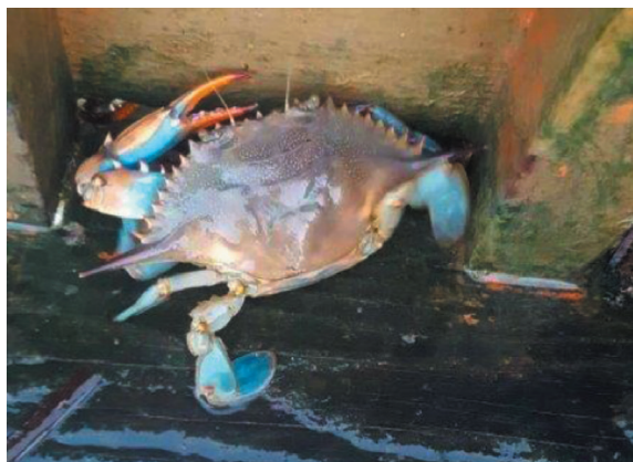
Fig. 2. Callinectes sapidus in NW Sicily, female