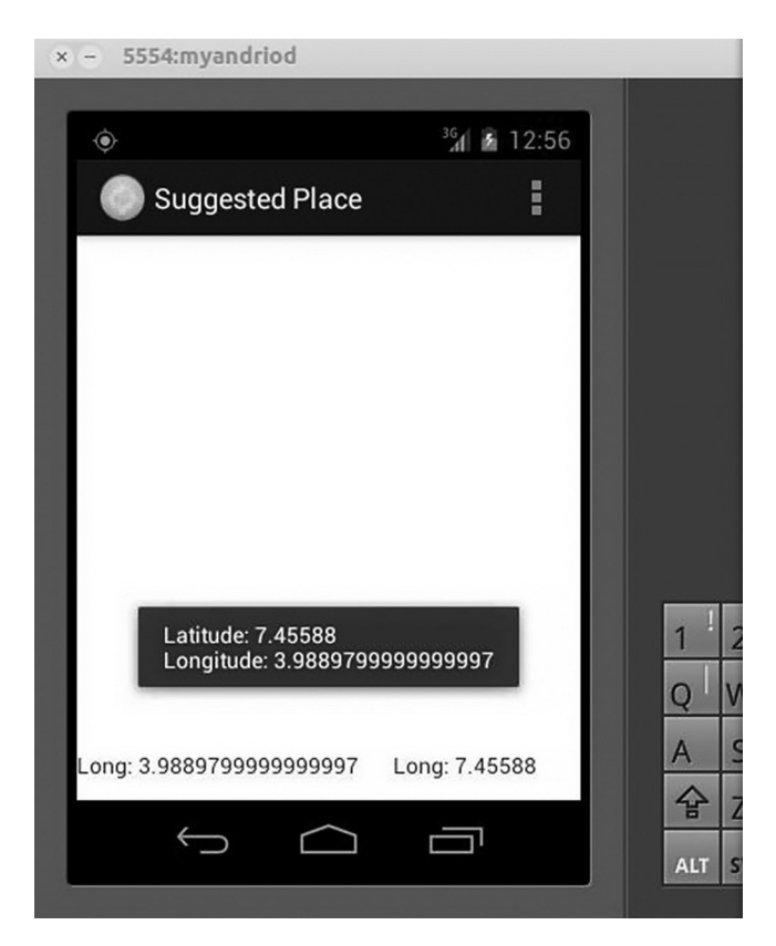
Figure 3. Location coordinates with reference to user's position