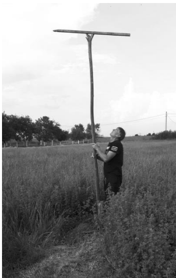
Figure 1. Installed T-standpoint in the observed lucerne crop

The research comprised an installation of two T-standpoints at approximately 1 ha of lucerne crop in the village of Ernestinovo in Croatia and monitoring of predatory birds descending to installations, waiting for the prey and landing to the ground (assumed as an attack) during 10 months of observation (from June 2018 to November 2018 and from March 2019 to June 2019). T-standpoints were about 3 m high (Figure 1).