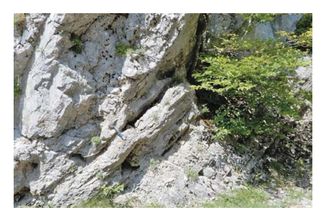
Figure 18: The boundary between the Lower and Middle Jurassic carbonates (marked by a geological hammer): the topmost part of the Lower Jurassic deposits is composed of thin-bedded brownish dolomite of the Spotted Limestone Unit. The base of the Middle Jurassic deposits is represented with dark-greyish, thick bedded limestones of the lithostratigraphic unit Lower Alan Limestones and Dolomites