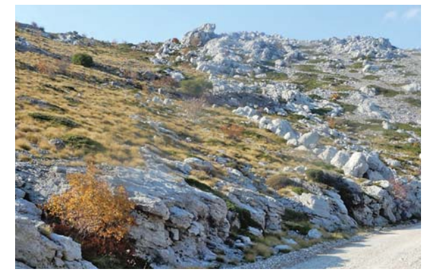
Figure 23: The boundary Middle – Upper Jurassic between the Middle Jurassic Upper Alan Limestones (karst relief on the right part) with the Upper Jurassic Alanac Limestones (flattened slope with grass on the left)