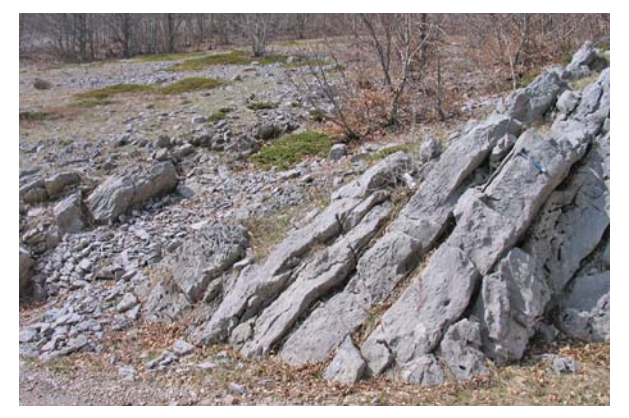
Figure 16: Geological boundary within the Lower Jurassic carbonates between Lithiotid Limestone and Spotted Limestone and a complex texture of the bed of a Lithiotid Limestone bed (with a geological hammer, 33 cm long): the lower part – transported Lithiotid shells, the middle part – Lithiotid shells in living positions – very rare findings; the upper part – again relocated Lithiotid shells

Majstorska Cesta has been cut into by the Alan limestones up to a point 200 m S from Kraljičina vrata, where the boundary of the Middle and Upper Jurassic is exposed (see Figure 23 ), i.e. between the Middle Jurassic Alan Limestones and the Upper Jurassic Alanac Limestones and Dolomites. Alanac Limestones are very fossiliferous, comprising the abundant foraminiferal tests of genera Andersenolina and Chablaisia , located at hairpin-bends and all over the SI slope of the Kuće Marunića Ridge. There is contact with younger, Upper Jurassic, Clypeina Limestones, which spread toward Tulove Grede locality. On their N slope, there is a large sinkhole, created by the destruction of the subsurface cave roof. From the top, the valley Jurkovića Vrti is composed