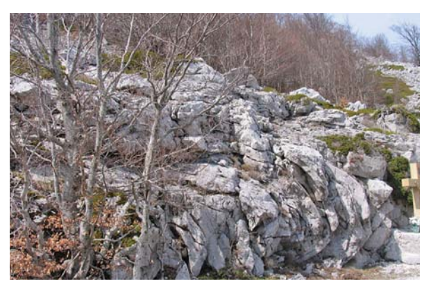
Figure 22: Recumbent fold in the Middle Jurassic Upper Alan Limestones as a result of slumping (not tectonics) during the deposition on a subtidal slope, where calcareous detritus was deposited and reached the critical weight for the gravitational transport and folding of strata