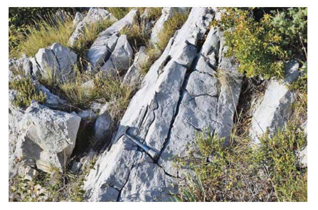
Figure 26: Lower Cretaceous limestones outcropped by Majstorska Cesta, in the base of the Velebit Breccia in the Meki Doci locality (scale – geological hammer is 31 cm long)