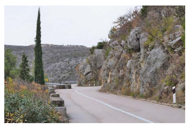
Figure 27: Majstorska Cesta in the Zrmanja River Canyon near Obrovac, cut in by the thick conglomerate strata of the Palaeogene Promina deposits

roundabout, the road leaves the breccia and runs through the Lower Cretaceous limestones. The roundabout gives the best view of Tulove Grede and the S slope of Velebit Mt. where the road passes. At the very end, the road reaches the former alumina factory, where it passes over the Vrakon dolomites and dolomitic breccia and the Upper Cretaceous rudist limestones. The road ends at the bridge over Zrmanja River in Obrovac, in Promina conglomerates and sandstones (see Figure 27 ) with intercalations of marlstones.