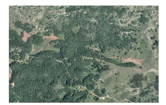
Figure 8: Satellite image (Arkod) of the Crveni Potoci (=Red Creeks) and Bađek areas. Red soil produced by the weathering of the reddish Raibl siltites and sandstones is visible in the centre of the right part of the photo