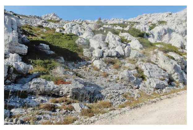
Figure 21: Weathered massive Upper Alan Limestones