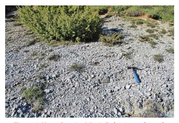
Figure 6: Upper Permian Mizzia Dolomite on the peak above road bend from Šulentić to Egeljac (scale – geological hammer is 31 cm long); very rich in microfossils – calcareous algae, the most important is famous species Mizzia velebitana (described in the Permian of the Velika Paklenica) and fusulinid foraminifera

In the majority of Sv. Rok, the road was built over the Middle Triassic Diplopora Limestones, and, near Šulentić, on the Permian Mizzia Dolomites (see Figure 6 ). Further, up until Egeljac, it is positioned on the alluvial deposits between the Diplopora Limestones and the Mizzia Dolomites.