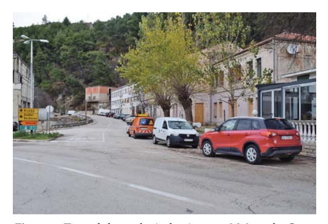
Figure 3: Toward the geological point near Majstorska Cesta in Obrovac, along the bridge on the E (right) bank of the Zrmanja River

represent a natural geological museum of carbonates of the Dinaric Karst. The road was built from Obrovac to Sveti Rok, but the geological review in this paper runs in the opposite direction, thus respecting the rule that the oldest rocks are the first to be described. Figures 4 and 5 present the parts of the Basic Geological Maps of SFRY (1:100000), Obrovac ( Ivanović et al., 1973 ) and Udbina ( Šušnjar et al., 1973 ) sheets, with selected parts of the geological maps of Lika and Velebit where the road was constructed.