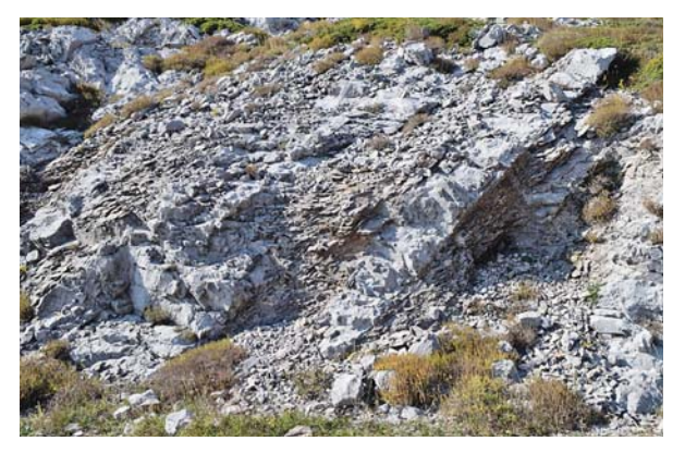
Figure 20: Alteration of greyish limestones and brownish dolomites, lithostratigraphic unit the Lower Alan Limestones and Dolomites