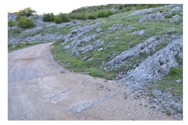
Figure 12: Locus typicus of the lithostratigraphic unit Mali Alan Limestones and Dolomites on Mali Alan Pass: an alteration of greyish limestones and brownish, late diagenetic dolomites; limestones are rich in remains of the fossil calcareous algae, mostly of the genus Palaeodasycladus; strata thicknesses vary from 30 to 60 cm