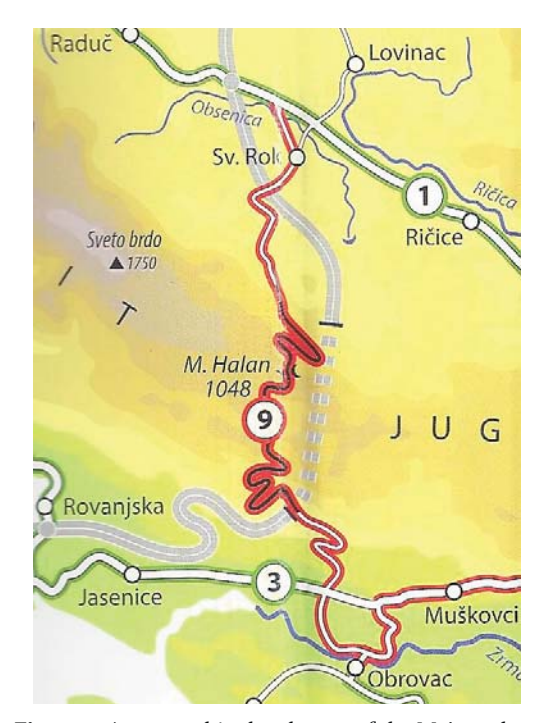
Figure 1: A geographic sketch map of the Majstorska Cesta location (after Cernički & Forenbaher, 2016 ; legend: 1 = Dalmatina Road, 3 = Obrovac roundabout and road toward Jesenice, 9 = Majstorska Cesta)

Majstorska Cesta had been planned with the purpose to shorten the voyage from Vienna, as a capital and land-