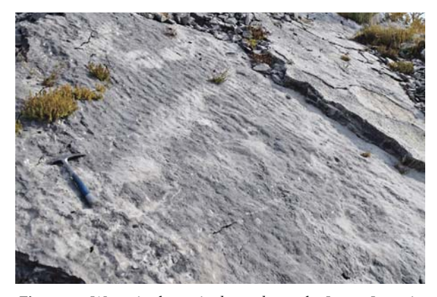
Figure 13: Wave ripples – ripple marks on the Lower Jurassic strata of the Mali Alan Limestone at the Majstorska Cesta towards the abandoned quarry (scale – geological hammer is 31 cm long)