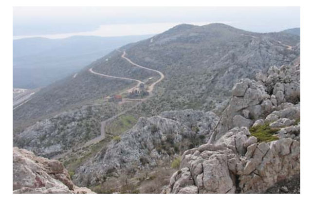
Figure 25: Majstorska Cesta W and SW of Tulove Grede was built up on the Velebit Breccia

Majstorska Cesta, from Tulove Grede to Zaton Plain, passes mostly through Velebit Breccia (see Figure 25 ), occasionally through the Lower Cretaceous limestones (see Figure 26 ). Before the crossing with the Obrovac