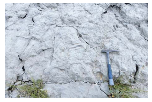
Figure 14: Desiccation cracks on the bedding surface of the Mali Alan Limestone unit along Majstorska Cesta near the abandoned quarry (scale – geological hammer is 31 cm long)

occurs (see Figure 22 ), probably representing a synsedimentary sliding structure – slump.