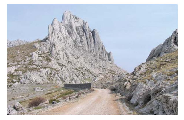
Figure 24: Majstorska Cesta from Nekić to Tulove Grede is built over the Upper Jurassic Clypeina Limestones with intercalations of brownish late diagenetic dolomites

carbonate panels and columns. Majstorska Cesta is cut into the breccia on the W side of Tulove Grede Ridge.