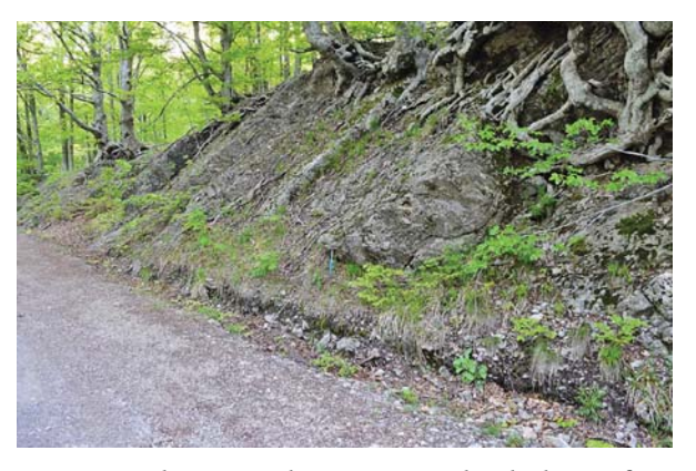
Figure 10: The Main Dolomite strata with a thickness of 30 – 110 cm in the cutting of Majstorska Cesta, on the N slope of the Mali Alan Pass (scale – geological hammer is 31 cm long)