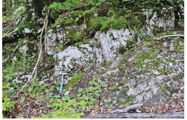
Figure 11: The Triassic – Jurassic boundary: the Triassic gray-brownish Main Dolomite is overlain by the bright layer of the Lower Jurassic limestone of the Mali Alan Unit (scale – geological hammer is 31 cm long)

The road now reaches the locus typicus of the Lower Jurassic deposits – the Mali Alan Limestones and Dolomites (see Figure 12 ), which extend towards the shep-