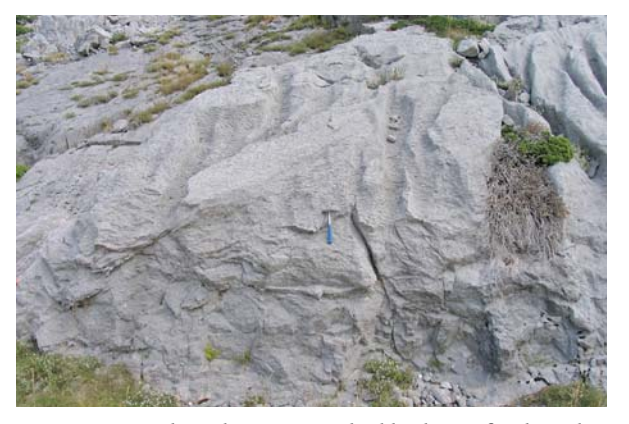
Figure 15: Lithiotid coquina – a bed built up of Lithiotid shells (similar to the contemporary fan mussel Pinna nobilis ), broken by the sea currents or storm waves from their living spaces and transported into the protected, calm environment; the photo was taken from the entrance of the abandoned quarry in Lithiotid Limestones; beds without shells contain numerous remains of the Lower Jurassic foraminiferal genera Orbitopsella and Lituosepta

occurs (see Figure 22 ), probably representing a synsedimentary sliding structure – slump.