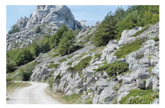
Figure 19: Karstified and fissured dark-greyish and greyish, thick-bedded Middle Jurassic carbonates of the lithostratigraphic unit Lower Alan Limestones and Dolomites