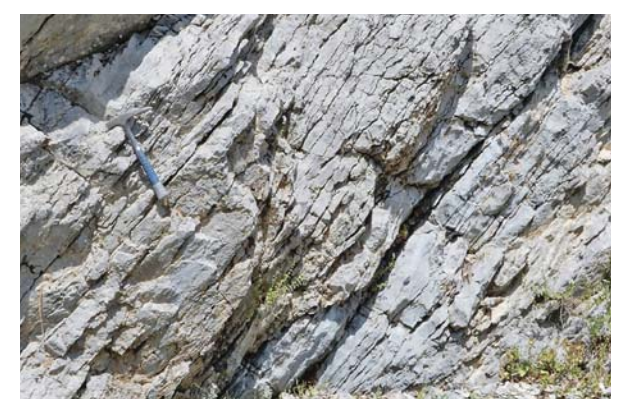
Figure 17: Toarcian Spotted Limestone with a well visible thin bedded pattern of the deeper sea environments; location about 50 m S from the abandoned quarry and elevation point of 1005 m (scale – geological hammer is 33 cm long)