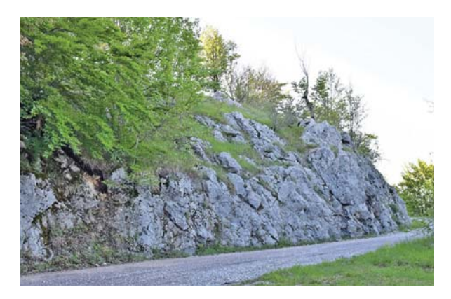
Figure 9: Middle Triassic, Ladinian Diplopora Limestones at the section of Majstorska Cesta on Velebit Mt. (N slopes, at Šiljci Ridge)

The road now reaches the locus typicus of the Lower Jurassic deposits – the Mali Alan Limestones and Dolomites (see Figure 12 ), which extend towards the shep-