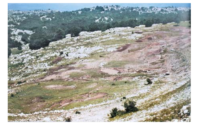
Figure 7: The boundary between the Middle and Upper Triassic deposits on the W part of Crveni potoci: Middle Triassic Diplopora Limestones (upper part), continental red Raibl siltstones and sandstones with lenses of conglomerates (middle part) and Upper Triassic Main Dolomite (lower part)