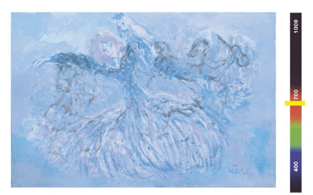
Figure 5 Animation in visible and NIR spectrum, http://www.nada.ziljak.hr/n136.mp4, exhibition catalogue: http://nada.ziljak.hr/Katalog-Mimara-2018.pdf

Spectroscopy is implemented for all "raw colors" from the fine art shop. Those colors can be used by painters as components in creating new colorants with desired qualities of light absorption in the visible and NIR spectra. Two images (V and Z images) exist in all paintings of old and contemporary masters and each color has its own characteristics of NIR light absorption.