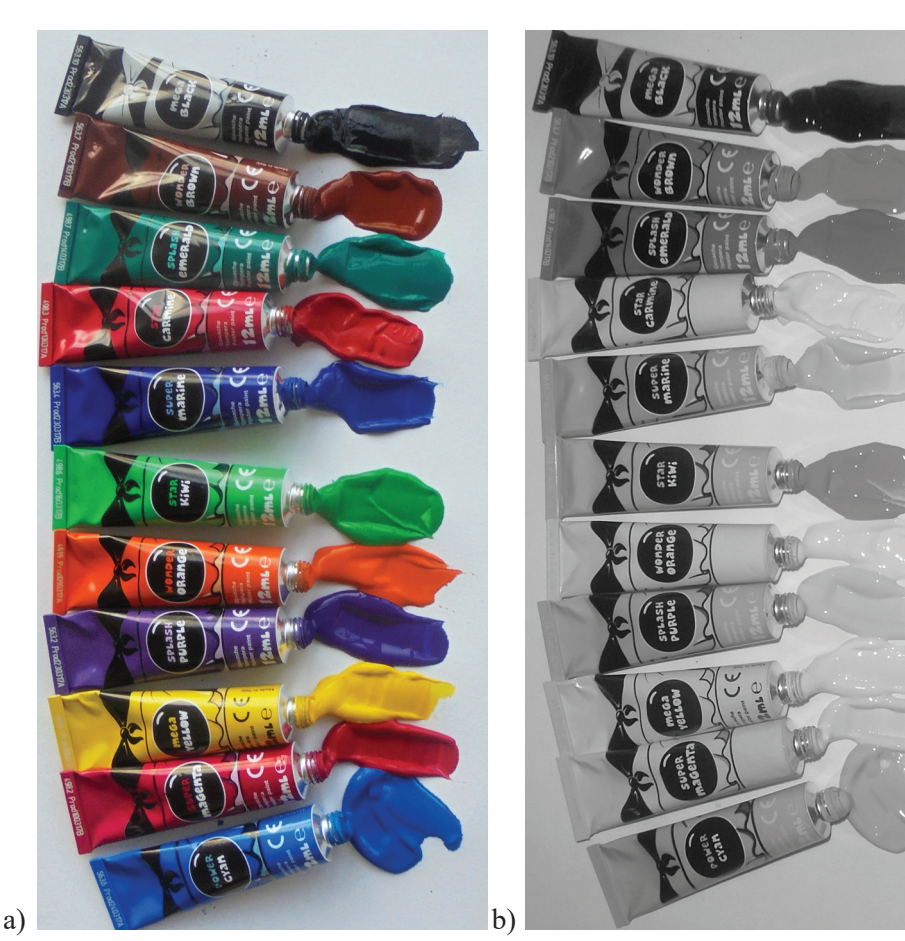
Figure 1 a) Tempera colorants for fine art paintings; b) NIR image of tempera colorants for measurment of Z value at 1000 nm

The topic of this article is the creation of dual paintings (two individual paintings on the same canvas) which were investigated with VIS and NIR forensic cameras [2]. The light absorption characteristics of colorants (i.e. dyes and pigments) used in fine arts (Figure 1) have been shown to have unique visible and NIR spectra (Figure 2). Some colorants absorb NIR intensively, while others reflect NIR wavelengths which can be seen in the corresponding NIR image (Figure 1b). An example of extreme light absorption change is the application of colored glazes on ceramics, which mature during the high temperature firing process [3]. This article is focused on colorants for painting on canvas [4]. The difference of these absorbance values has initiated the new painting approach called "Infrared Painting" [5].