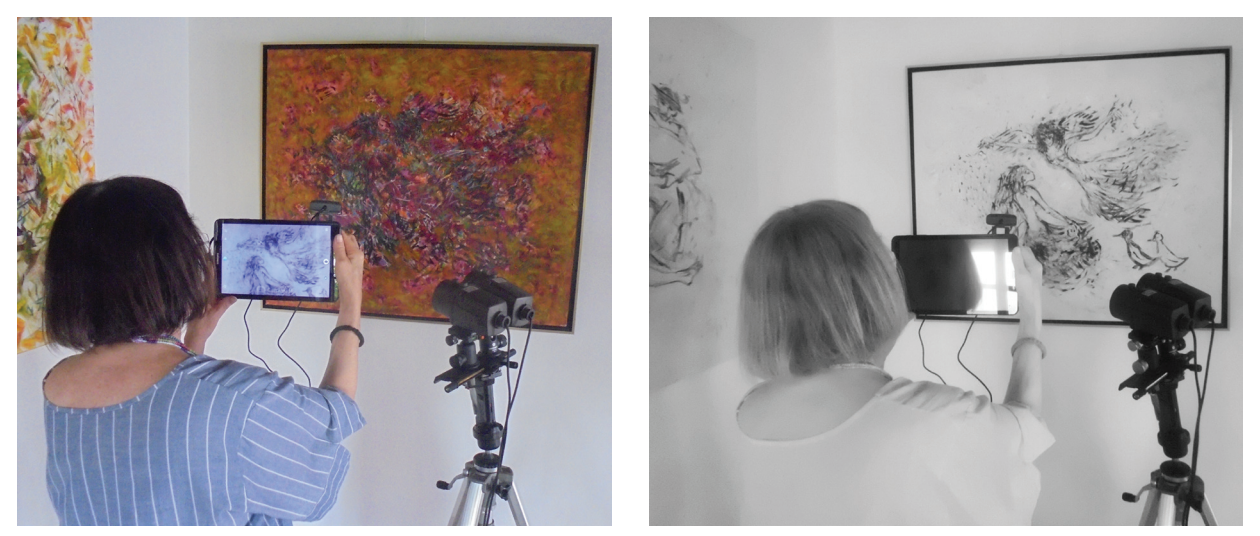
Figure 3 a) Dual observation and recording by RGB and NIR cameras; b) NIR record in gallery Zelina, VZ animation: http://www.nada.ziljak.hr/n108.mp4

NIR spectroscopy opens up the possibility of a new procedure in fine arts for restoration and protection of art works. The colorants have different characteristics which are independent of the NIR light absorption that do not depend on color tints or their lightness in the visible spectrum. Their difference is the basis of the creation of the invisible multicolor painting, which is singled out by the NIR camera, separately from the visible painting. Two paintings are created on the same canvas and each of them is recognized by its own camera. The paintings in the two spectral ranges, visible and near infrared, are exhibited in the Art Gallery, town of Zelina, Croatia (Figure 3). The NIR camera has been adjusted to 1000 nm for the dual painting observation [2].