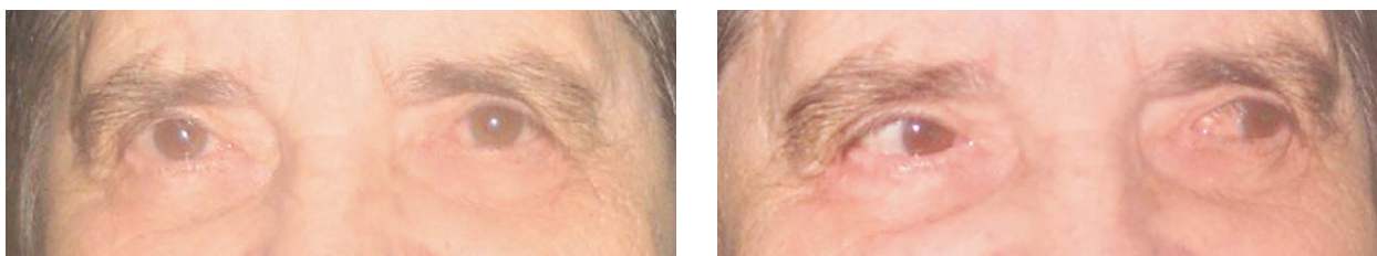
Fig. 5. Late postoperative result of surgical treatment of blepharospasm as per Anderson's method.