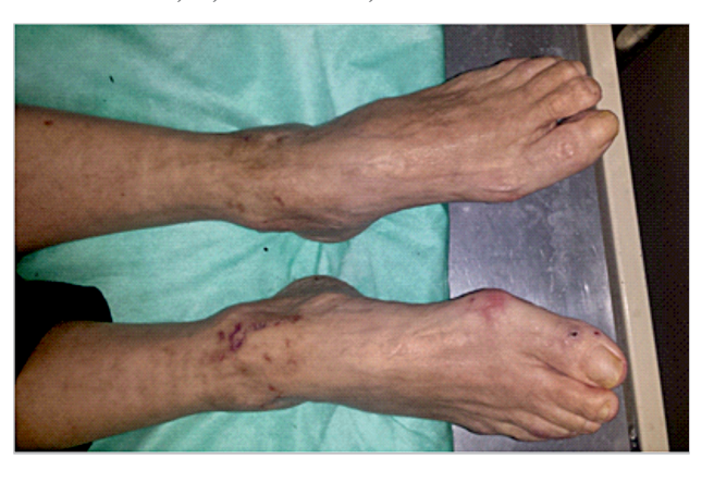
FIGURE 1C. REDUCTION OF SKIN LESIONS ON FOLLOW-UP SLIKA 1C. SMANJENJE KOŽNIH LEZIJA NA KONTROLNOM PREGLEDU

The patient was diagnosed with cryoglobulinemia and treated with high doses of glucocorticosteroids during initial hospitalisation (1000 mg for three days following with 500 mg for two days). She was discharged home with prescribed immunosuppressive therapy (prednisone) and antiviral therapy (ombitasvir, paritaprevir and ritonavir + dasubavir) for hepatitis C. On follow-up exams there was a gradual and substantial recovery of skin lesions (Figure 1c), eradication of chronic HCV infection with significant improvement in motor strength (4/5) of the legs.