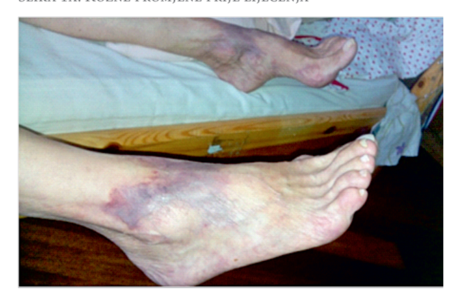
Figure 1a. Skin changes before treatment Slika 1a. Kožne promiene prije liječenja

Past medical history revealed arterial hypertension and surgery of the kidney in the childhood that required blood transfusion.