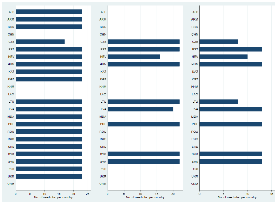
(g) Model 8