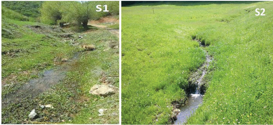
Fig. 2. Sampling sites in the Berisha Mountain, Kosovo (S1 Kishnarekë and S2 Nekoc).

nareskë (N° 42.544168; E° 20.876845; 707 meters a.s.l.). The second sampling station, S2, is located at the upstream area of the Lugu i Gashit streamlet, above Nekoc (N° 42.523249; E° 20.868111; 837 meters a.s.l.). Adult stonefly specimens were collected using entomological nets and hand picking. The sampling was carried during May 2017 and January 2018. Collected samples were preserved in 80% ethanol.