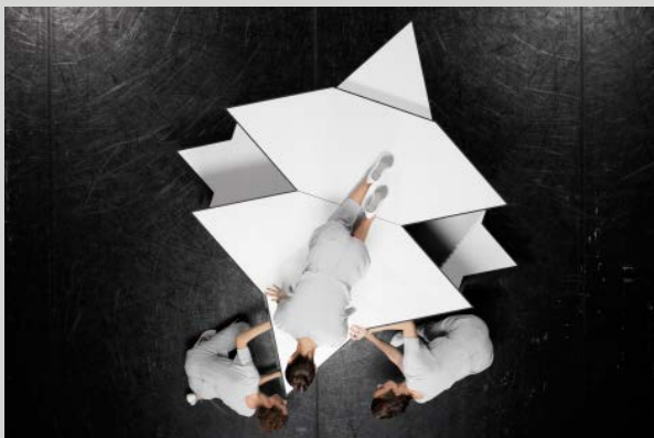
Jasmina Cibic, The Pavilion , 2015, 6 min 43 sec, single channel HD video, stereo. Courtesy of the artist. / Jasmina Cibic, The Pavilion , 2015., 6 min 43 sec, jednokanalni HD-video, stereo. Ljubaznošću umjetnice