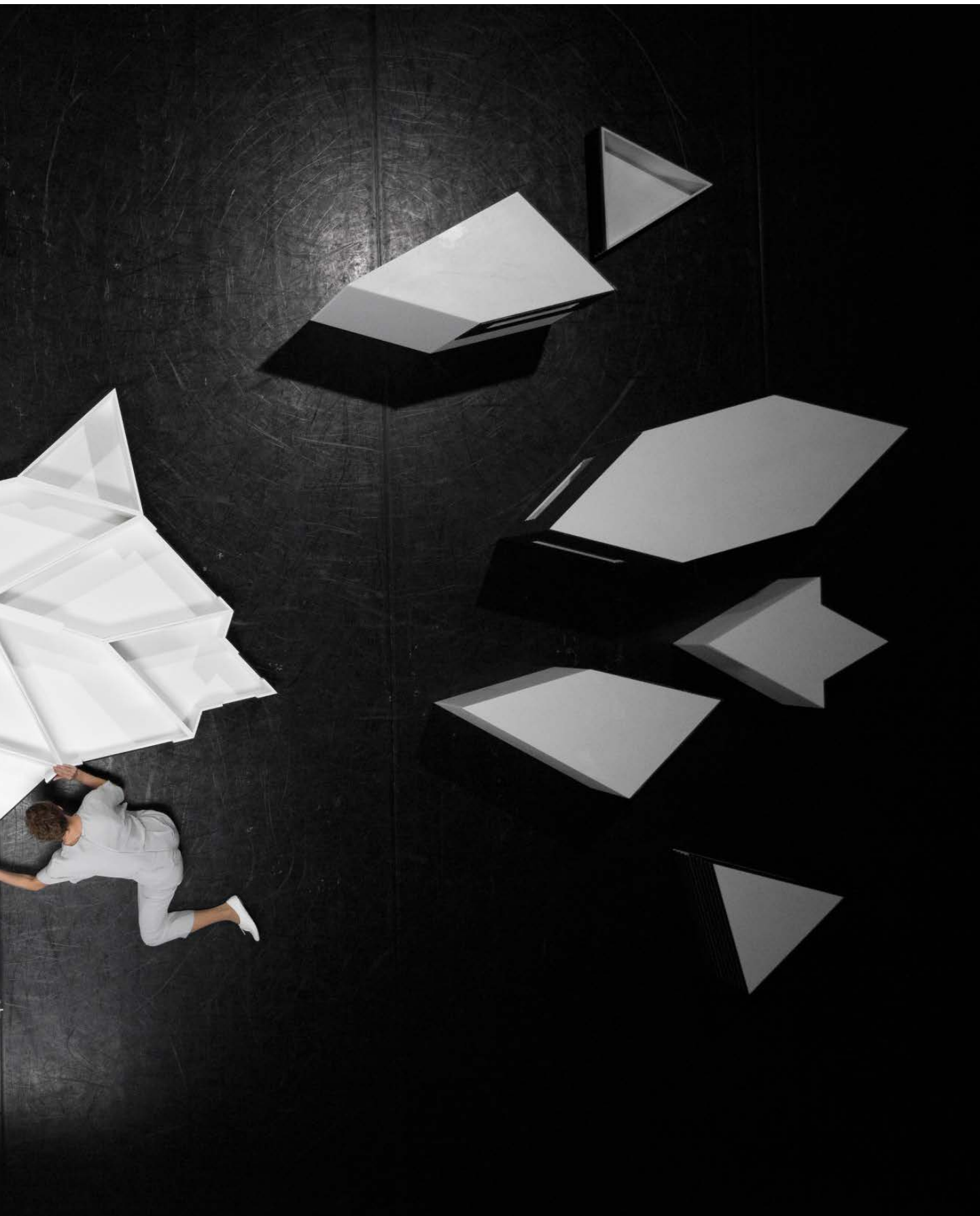
Jasmina Cibic, The Pavilion , 2015, 6 min 43 sec, single channel HD video, stereo. ↑ / Jasmina Cibic, The Pavilion , 2015., 6 min 43 sec, jednokanalni HD-video, stereo.