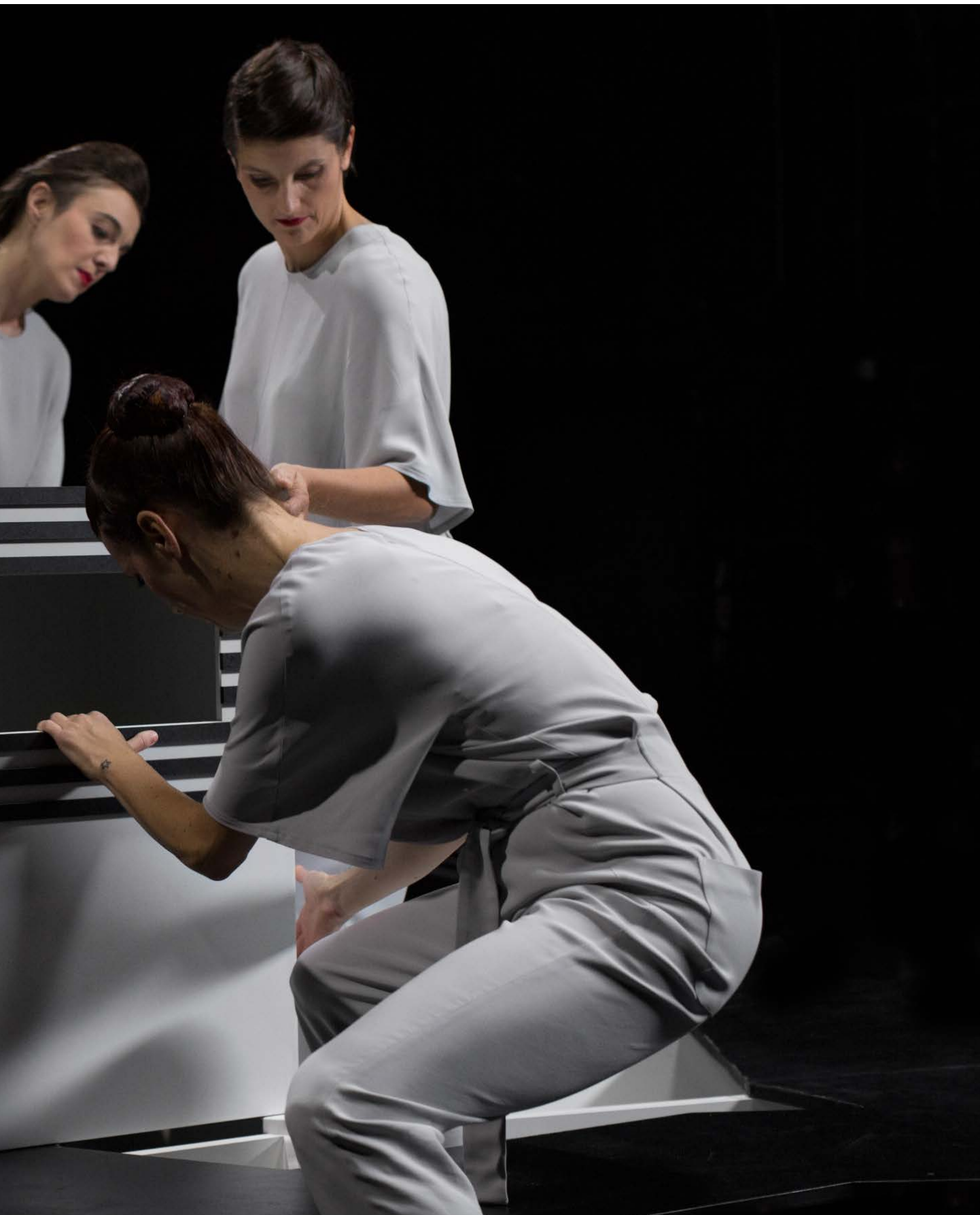
Jasmina Cibic, The Pavilion , 2015, 6 min 43 sec, single channel HD video, stereo. Courtesy of the artist ↑ / Jasmina Cibic, The Pavilion , 2015., 6 min 43 sec, jednokanalni HD-video, stereo. Ljubaznošću umjetnice