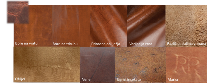
Figure 3. Traces - natural characteristics on animal skin [5]

Leather is divided by origin into natural and artificial leather; according to the natural source, it can be bovine, calf, sheep, goat, pig, horse, alligator, snakeskin, etc.; according to the purpose, it can be classified as leather for footwear, clothing, fancy goods, automotive and aerospace industry, and for the furniture industry, etc. [4]. The appearance and quality of natural leather is influenced by the living conditions in which the animal was raised. Traces on the skin are caused by insect bites, wounds, scars, veins, wrinkles, brand marks, etc., Fig. 3. [5]