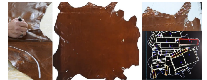
Figure 4. Leather defect marking and marker representation [8]

Properties of natural leather which are important in the automotive industry for car interior upholstery materials are abrasion resistance, mold resistance, resistance to long and cyclic stresses, elasticity, strength, shape stability, softness and comfort when in contact with the body, breathability, non-fraying selvages and easy care [1]. Table 1 gives the comparison of the properties of some materials used to make car upholstery [6].