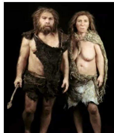
Figure 2. Neanderthal, Krapina [3]

against external influences, attacks of other humans and animals, Fig. 2. [3, 4].