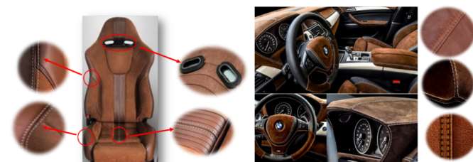
Figure 6. Leather car seat and interior of a BMW luxury car covered with natural leather [15-18]

According to the standard, needle threads are numbered 1, 2, 3 etc., while bottom threads are denoted in lowercase a, b, c etc. [14]. Seam types are standardized according to the ISO 4916 standard [11]. Seam type consists of five digits. The first digit represents the seam class (1 – 8), the second and third digits represent the arrangement of the sewing material layers (01 – 99), the fourth and fifth digits represent the position of the stitch or needle penetration (01 – 99) [14]. Figure 6 shows leather car upholstery and the interior of a BMW car in natural leather. The characteristic seam types are highlighted [15-18].