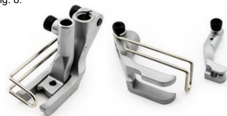
Figure 8. Dürkopp Adler double presser foot [20]

The double presser foot is most commonly used for sewing leather-upholstered car seats. It consists of the external presser foot that holds the material and the internal presser foot that helps transport the material, Fig. 8.