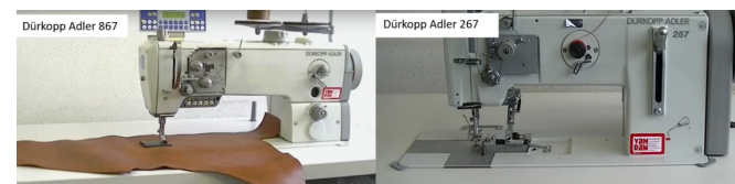
Figure 7. Dürkopp Adler sewing machines for sewing leather car upholstery [19]

Sewing car upholstery requires more robust sewing machines adapted to sewing thicker and multi-layered materials. The sewing machine should be able to sew materials of different raw material content and thicknesses without damaging the needle, thread and material. An example of a car upholstery sewing machine produced by Dürkopp Adler is shown in Fig. 7. Its optimal sewing speed amounts to about 2800 min -1 . These machines can be made with extended head and free arm to facilitate the handling of a larger surface material during sewing.