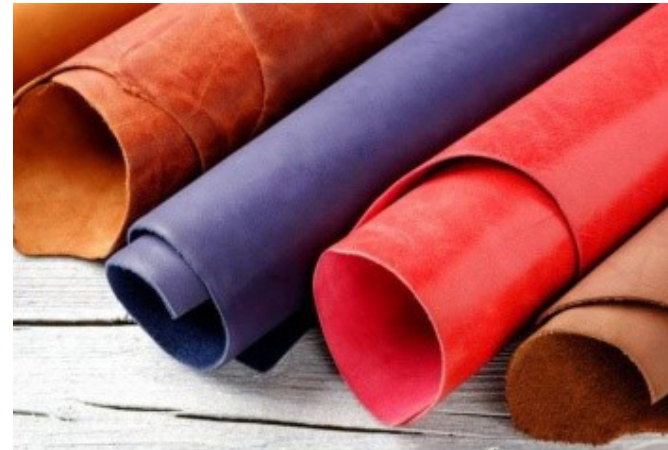
Figure 1. Natural leather [1]

Materials used to make car interior upholstery for vehicles are made of different materials by employing various technological processes. Natural leather is one of the most expensive, but also the most desirable materials used for seat upholstery and car interior. With its exceptionally beautiful and luxurious appearance, it attracts the customer and contributes to their decision to buy the car, Fig. 1.