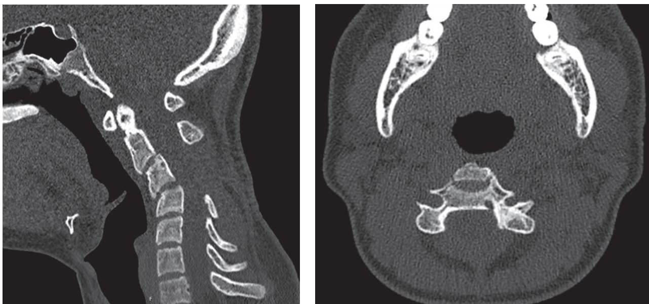
Fig. 3. a) Control CT scan after six months showed substantial progression of the cervical kyphosis and b) no residual cyst progression was seen in the left dorsal part of the C3 vertebra body.

spine immobilized in semi-rigid cervical collar because no cervical fusion was done. In the two-month clinical follow-up patient had good postoperative recovery without any symptoms and the cervical immobilization was removed. CT scans demonstrated no tumor recurrence or progression of the cervical kyphosis. Another control CT scan was