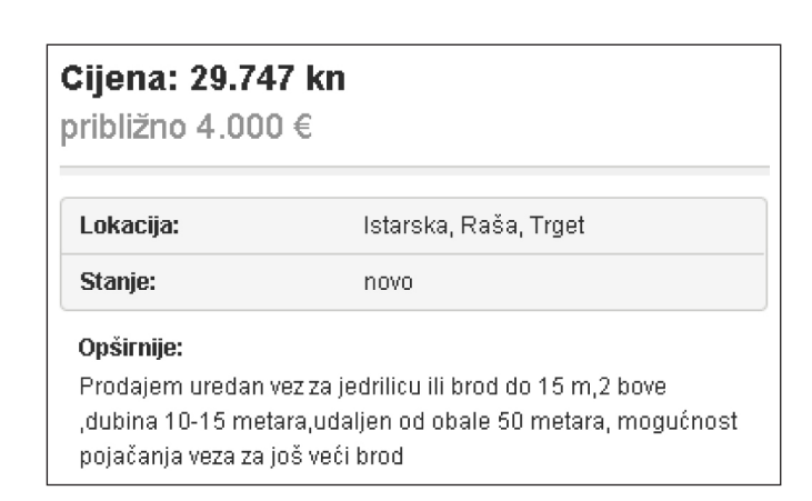
Figure 3 Advertisement for selling a berth 2