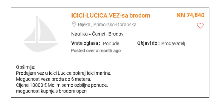
Figure 2 Advertisement for selling a berth 1