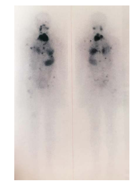
Figure 2. Whole-body iodine-131 scan of a patient with progressive disease and multiple metastatic lesions previously treated with vemurafenib.

the treatment (Figure 2). The third patient showed long-term improvement in lung status on morphological examination (MSCT) but did not want to perform a radioiodine scan.