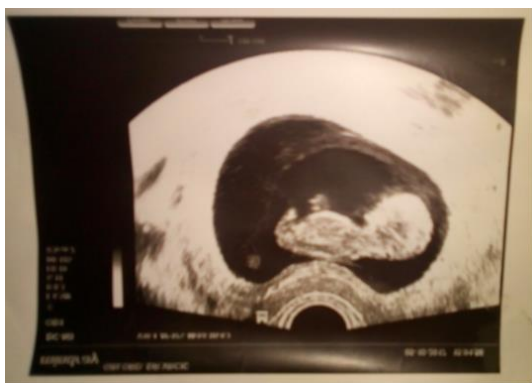
Figure 2. Ultrasound finding of a three-month-old child - a presentation of the child's development in amniotic fluid [10]

Deception is also a delusion that just because something cannot be seen it does not exist. Maybe looking from the beach the sea sometimes seems crystal clear, but somewhere “far far away” there is still a large accumulation of garbage in the Pacific Ocean (Figure 3) [11, 12]. Garbage from, for example, Albania and other southern countries is also flooded to the Croatian Adriatic coast. However, there are places on the planet where water is virginally intact. The water samples taken in Venezuela, on Mount Roraima showed 40,000 times higher energy activity than, for example, tap water [13] (although there is a marked difference between them).