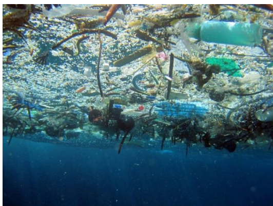
Figure 3. Large accumulation of floating debris in the Pacific Ocean - direct and long-term impact on the aquatic ecosystem [11]

Deception is also a delusion that just because something cannot be seen it does not exist. Maybe looking from the beach the sea sometimes seems crystal clear, but somewhere “far far away” there is still a large accumulation of garbage in the Pacific Ocean (Figure 3) [11, 12]. Garbage from, for example, Albania and other southern countries is also flooded to the Croatian Adriatic coast. However, there are places on the planet where water is virginally intact. The water samples taken in Venezuela, on Mount Roraima showed 40,000 times higher energy activity than, for example, tap water [13] (although there is a marked difference between them).