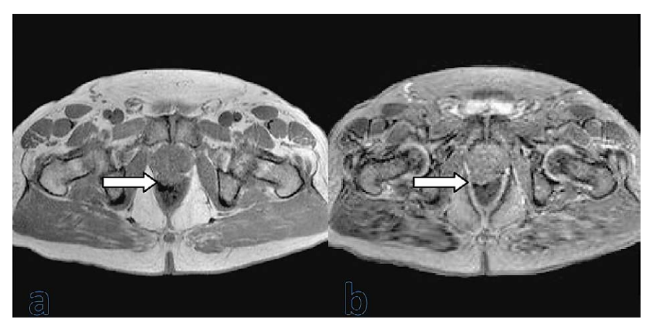
Figure 2. T1-weighted (a), T1 THRIVE post-contrast axial plane image (b) showed homogenous enhancement of the mass (shown by arrow)