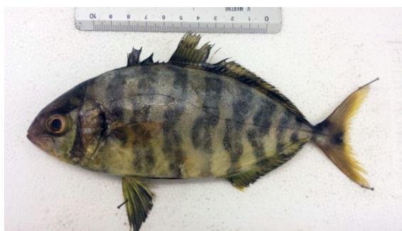
Fig. 1. Specimen of Seriola fasciata caught off the southern coast of Sicily

Specimen was an immature male, measured 20.5 cm TL and weighted 128.8 g. The end of upper jaw relatively narrow, the typical irregu-