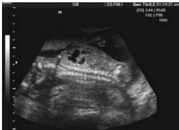
Figure 1. CCAM, a case diagnosed at 24 weeks, showing numerous cystic lesions in the lower right pulmonary lobe. Axial view

Slika 1. Slučaj dijagnosticiran s 24 tjedana, prikazane su brojne cistične tvorbe u desnom donjem plućnom režnju. Aksijalni ultrazvučni presjek