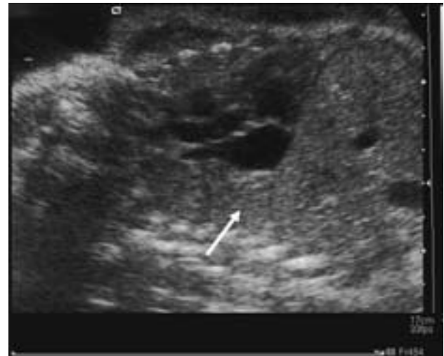
Figure 6. Regression of the lesion in the lower left pulmonary lobe at 36 weeks of gestation

Prenatal diagnosis is incidental in most of the cases by routine ultrasound. 8 Sonographically, CCAM appears as