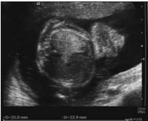
Figure 5. CCAM, transverse view of the lower part of thorax at 28 weeks fetus

Slika 4. Ultrazvučna slika CCAM u fetusa od 28 tjedana. Vidi se cista od 26 mm. Poprečni presjek