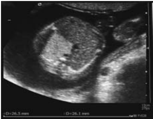
Figure 4. CCAM, a case diagnosed at 28 weeks showing a cyst of 26 mm. Transverse view

Slika 4. Ultrazvučna slika CCAM u fetusa od 28 tjedana. Vidi se cista od 26 mm. Poprečni presjek