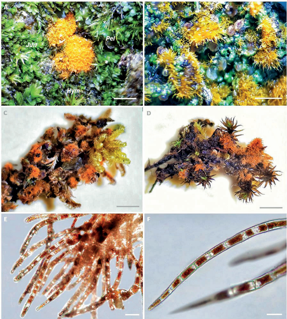
Fig. 2. (A) Patches of Trentepohlia aurea with bryophytes on the site beneath the waterfall on the Kozjak Lake on the Plitvice Lakes, scale = 2 cm ( Hym - Hymenostylium recurvirostrum , Jun - Jungermannia atrovirens , Pel - Pellia endiviifolia ); (B) patches of T. aurea from the Kozjak Lake site incorporated with lichen Collema auriforme within bryophytes, scale = 5 cm; (C) T. aurea and C. auriforme covering the bryophyte Ctenidium molluscum , scale = 1 cm; (D) T. aurea and C. auriforme covering bryophyte Hymenostylium recurvirostrum , scale = 1 cm; (E) detailed structure of T. aurea thaluss showing uniseriate filaments, scale = 100 \mu\text{m} ; (F) detailed structure of T. aurea filament showing cylindrical cells, scale = 50 \mu\text{m} .

of alga ranging between 0.5 and 15 cm in diameter were densely arranged on a surface of approximately several dozen square meters, mostly merged in larger clusters (Fig. 3D, E). The patches inhabiting a stone wall and limestone rocks were found in the close proximity of bryophytes, mainly Ctenidium molluscum and Encalypta streptocarpa , with a few vascular plants scattered in fissures (Tab. 1). Algal patches covered the rock