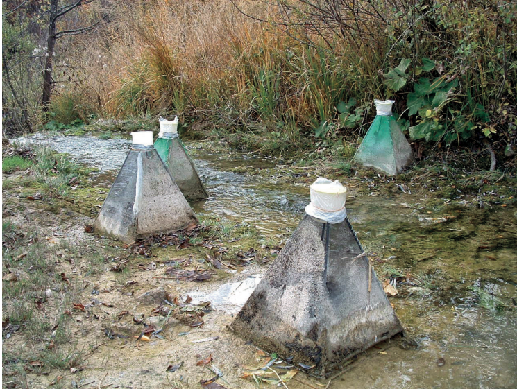
Fig. 2. Emergence traps at the Korana River site in Korana village.

Family: Hybotidae Meigen, 1820 Subfamily: Tachydromiinae Meigen, 1822 Tachypeza yinyang Papp & Földvári, 2002 Figs 3 – 4.