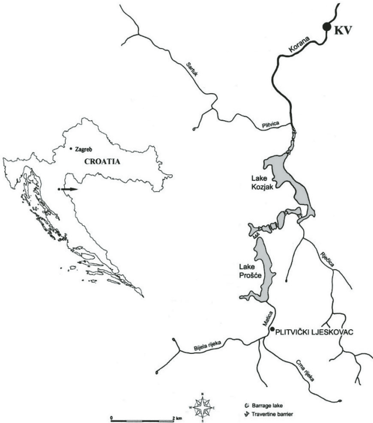
Fig. 1. Map of the study site: Korana River in Korana village (KV).

The single male was collected in an emergence trap set-up at Korana River in the village of Korana (Fig. 2). Six pyramid-type emergence traps were operated from February 2007 to February 2009. Traps were sited in such a way as to ensure representative sampling of emergence from all microhabitats present at each site. Each trap was a 50 cm tall, four sided pyramid with a base of 45×45 cm, fastened to the streambed to allow the free movement of larvae in and out of the sampling area. The side frames of the traps were covered with 1-mm mesh netting (Ivković et al. , 2013). The site completely dried out in the summer months of 2007 (July – mid September), but not in 2008.