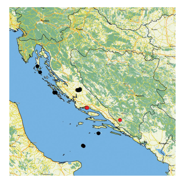
Fig. 1. Distribution of Fumaria judaica subsp. insignis in Bosnia and Herzegovina and Croatia (indication of localities: red circle - new chorological data; black circle - old literature data).

During fieldwork conducted in Split (Dalmatia) and Počitelj (Herzegovina) in April 2018 and April 2019, several specimens of F. judaica subsp. insignis were collected. The specimens were identified according to LIDÉN (1986) and deposited in the Herbarium of the National Museum of Bosnia and Herzegovina (SARA 51998; 60018). Digital photographs and GPS coordinates were taken in the field. Plant taxonomy and nomenclature followed the Euro-Med checklist (Euro+MED 2006). The distribution of the taxon in Bosnia and Herzegovina and Croatia is shown on the map using standard 10 x 10 km UTM grid. Localities gathered from the literature are indicated in black on the map, while new data are indicated in red (Fig. 1).